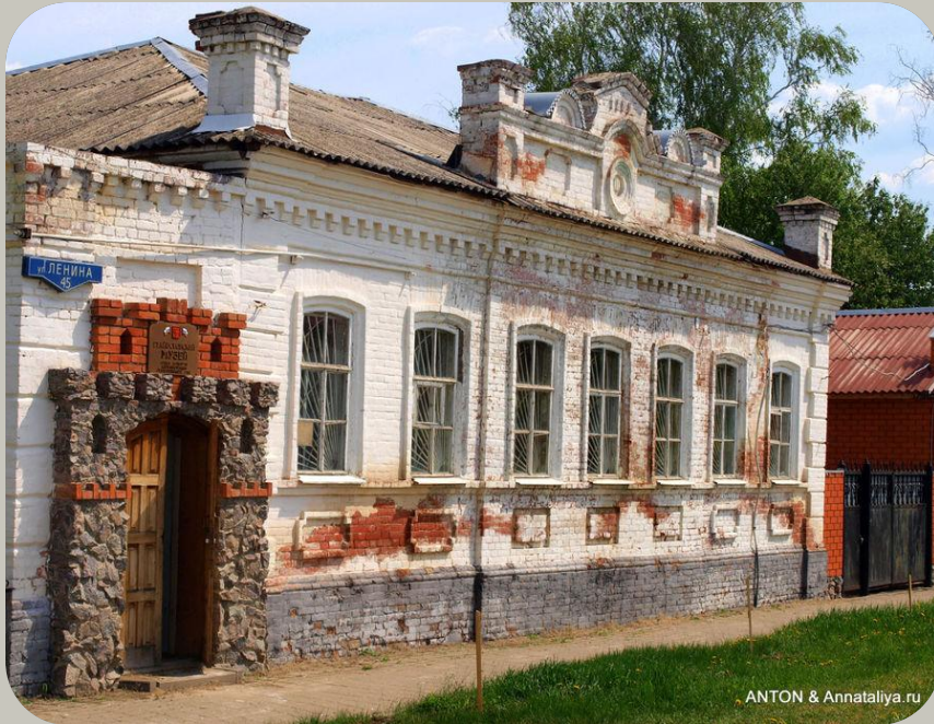
Graivoron ethnography museum