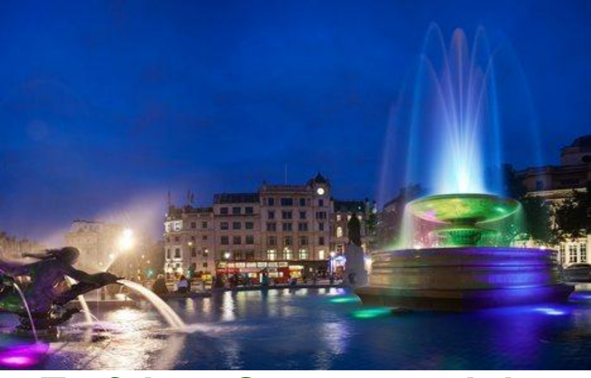
Trafalgar Square at night