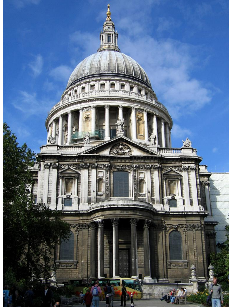
St. Paul's Cathedral