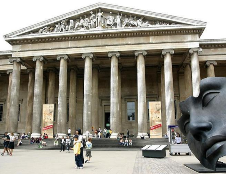
The British museum