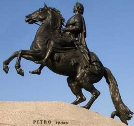
PETRO PAVLOVICH CATARINA SECUNDA MDCCCLXXXII

Americans are sure that there are only 2 big cities in Russia – St. Petersburg & Moscow .