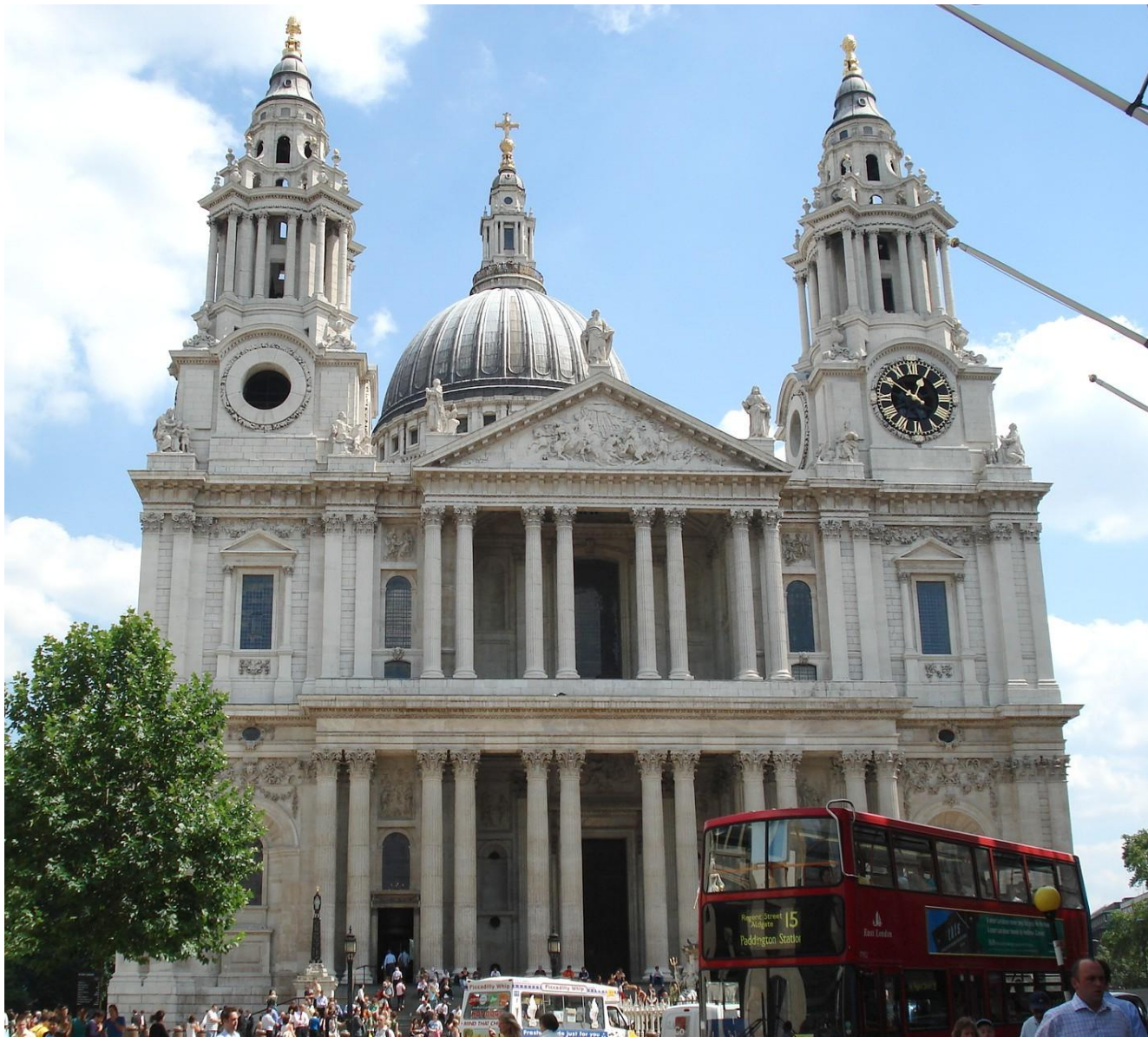
St. Paul's Cathedral is the residence of the Bishop of London.