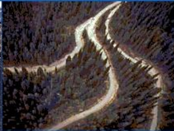
Forest Mountains in State Idaho