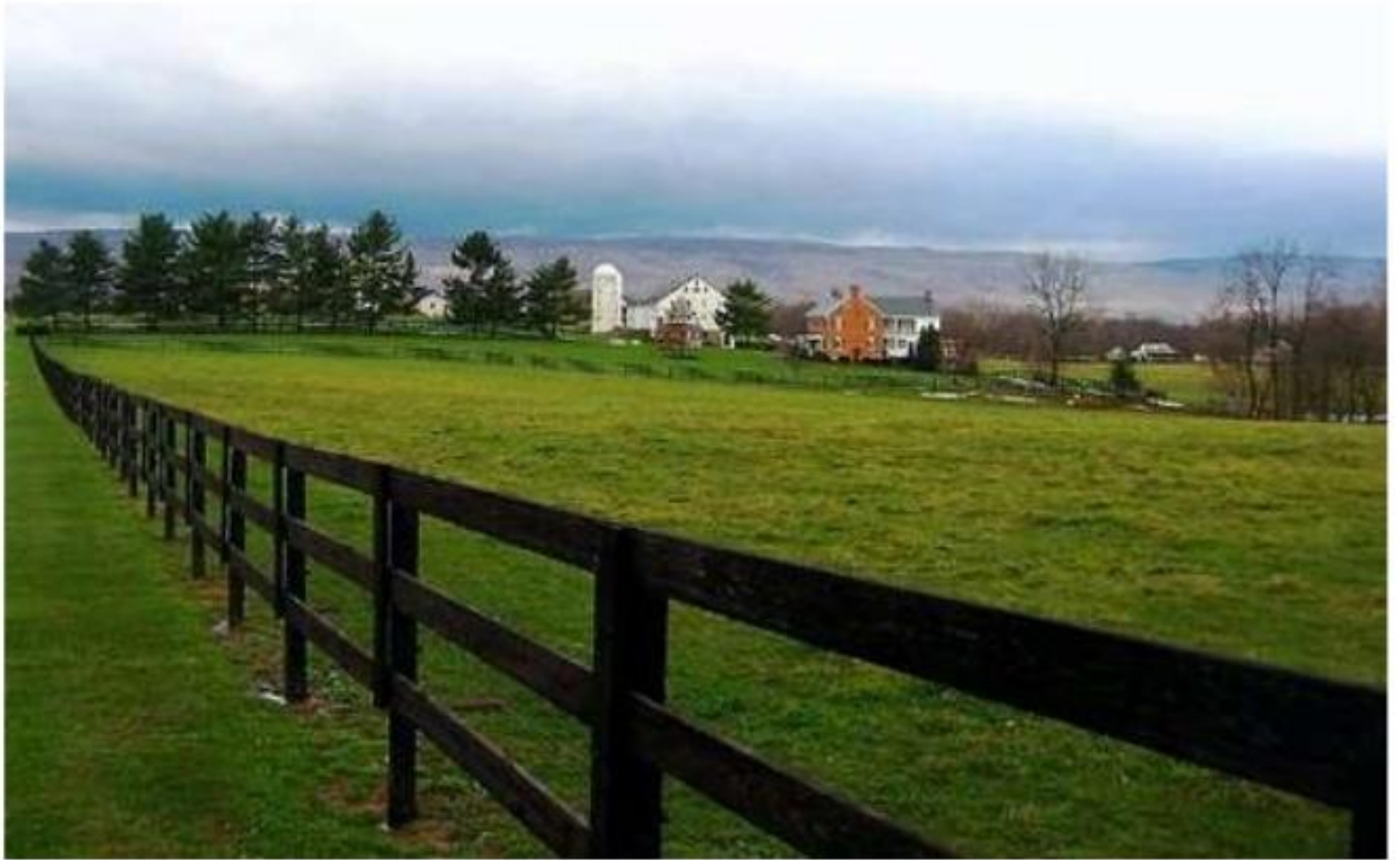
Farm in countryside, America