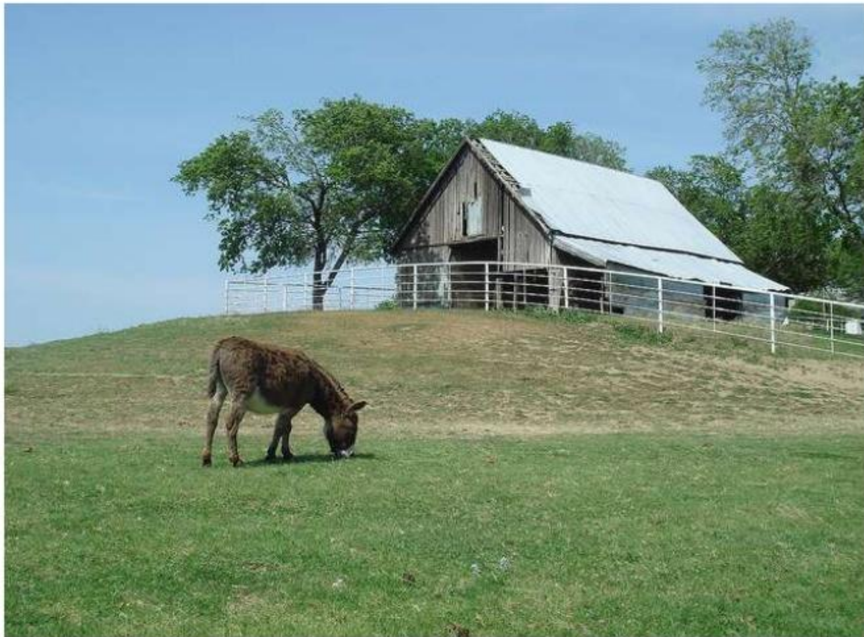
Farm in Texas