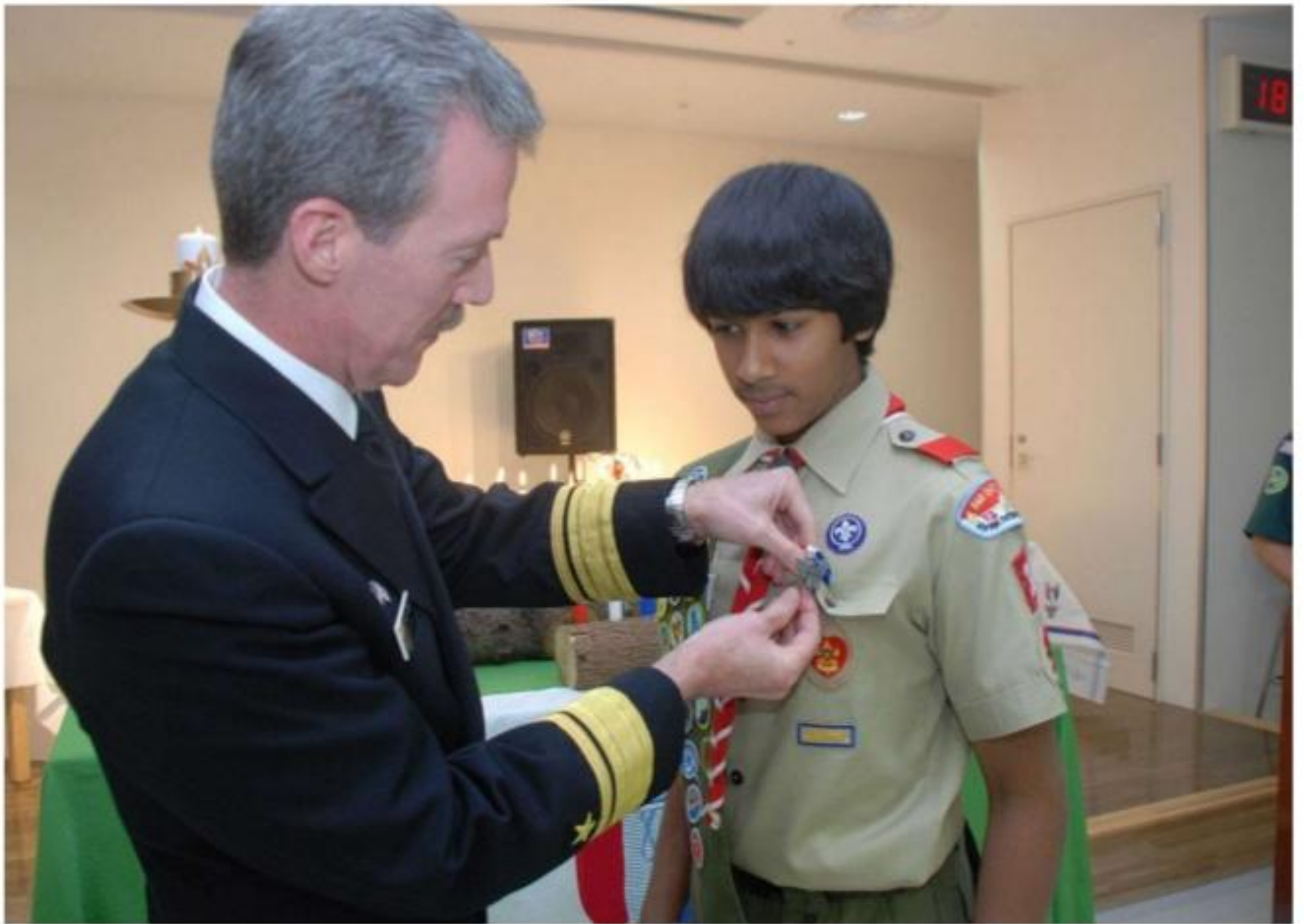
A boy scout member receives badge for helping Japan during disaster