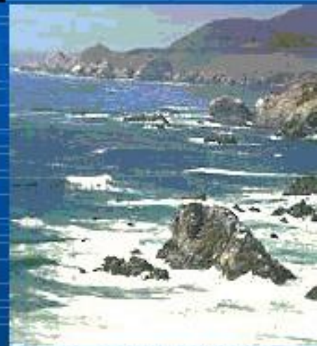
The coast of the Pacific ocean.