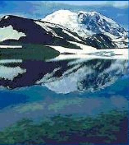
Icy Lake, State Washington

The USA is a country of natural wonders. The country has almost every kind of weather.