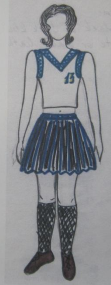
Girls uniform. White top, dark blue pleated miniskirt, white or black plus-fours, black leather sport shoes.