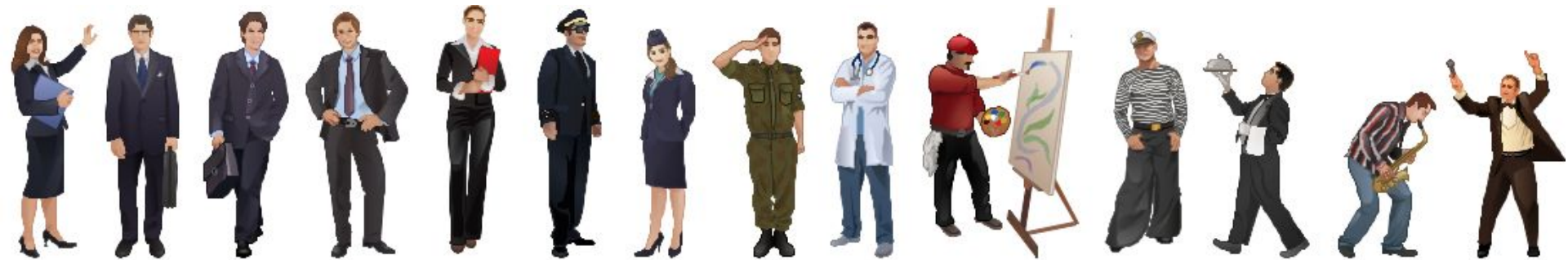
Clerk Clerk Clerk Manager Secretary Pilot Flight Attendant Soldier Doctor Artist Seaman Waiter Musician Presenter