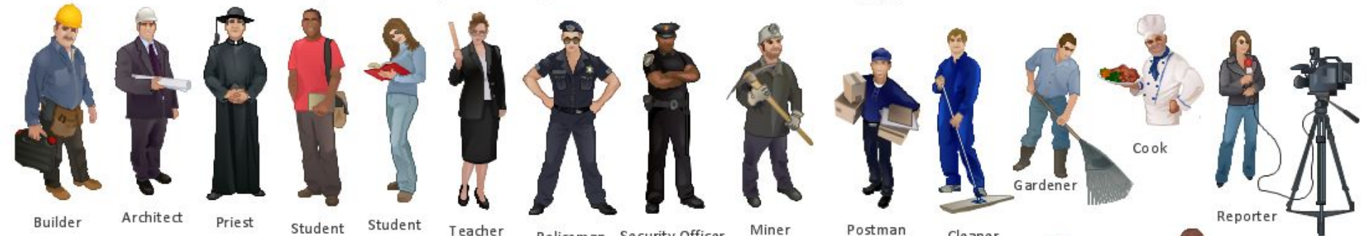
Builder Architect Priest Student Student Teacher Policeman Security Officer Miner Postman Cleaner Gardener Cook Reporter