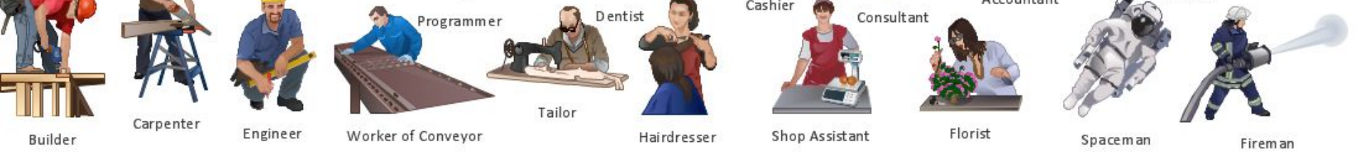
Builder Carpenter Engineer Worker of Conveyor Tailor Hairdresser Shop Assistant Florist Spaceman Fireman