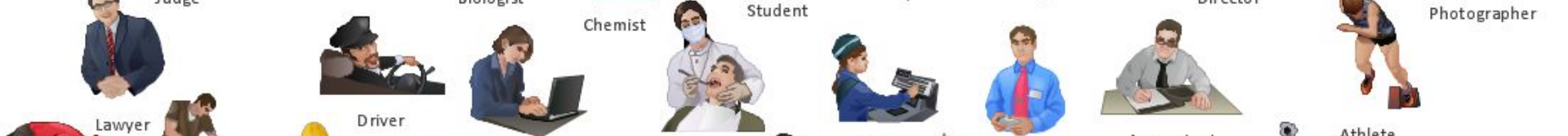
Lawyer Driver Programmer Dentist Cashier Consultant Accountant Athlete