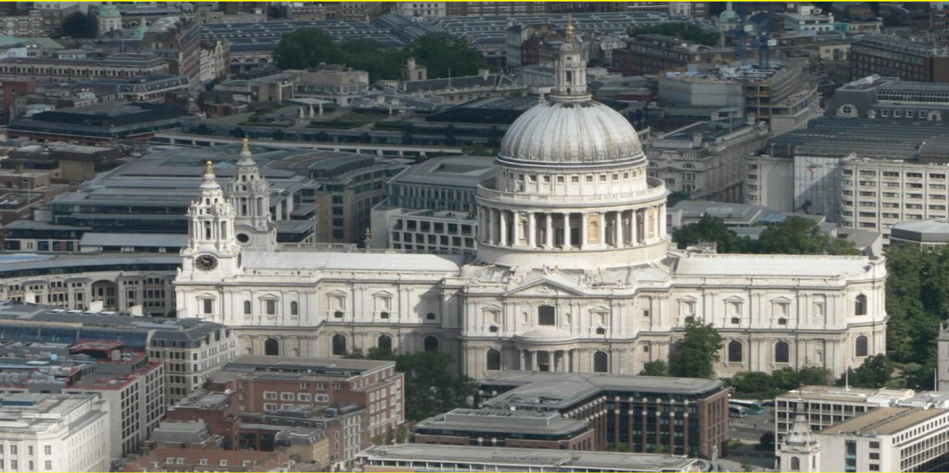
7. St. Paul's Cathedral.

It was built on the highest point of London 300 years ago. It is the London Bishop's residence and is the most popular place of visit. The price of visit is £16.