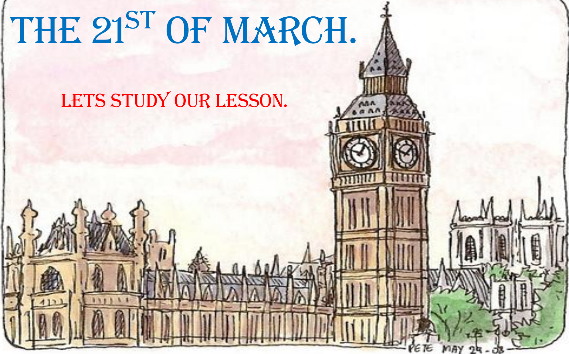
The Houses of Parliament, from county hall