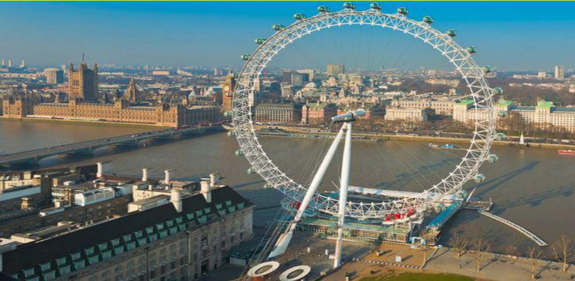
4. London Eye.

It is one of the biggest observation wheels in the world. Its height is 135 meters. It has 32 cabins which symbolize 32 districts of London. It takes 30 minutes to make a full circle. But it is the view you will never forget. The cost is about £20.