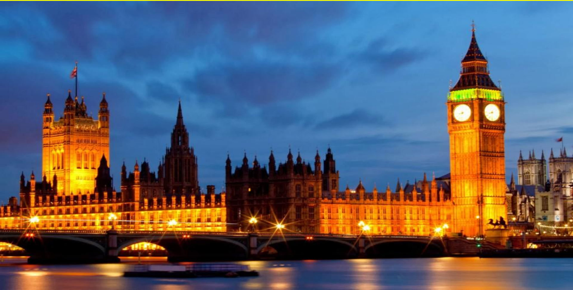
1. The Big Ben.

The world-known clock. Everyday about 500 tourists come to London to see the Big Ben. Built in 1858, it was named after an architect whose name was Ben (Benjamin). The interesting fact is that you are not allowed to get inside the Big Ben if you aren't an Englishman. No tourists allowed.