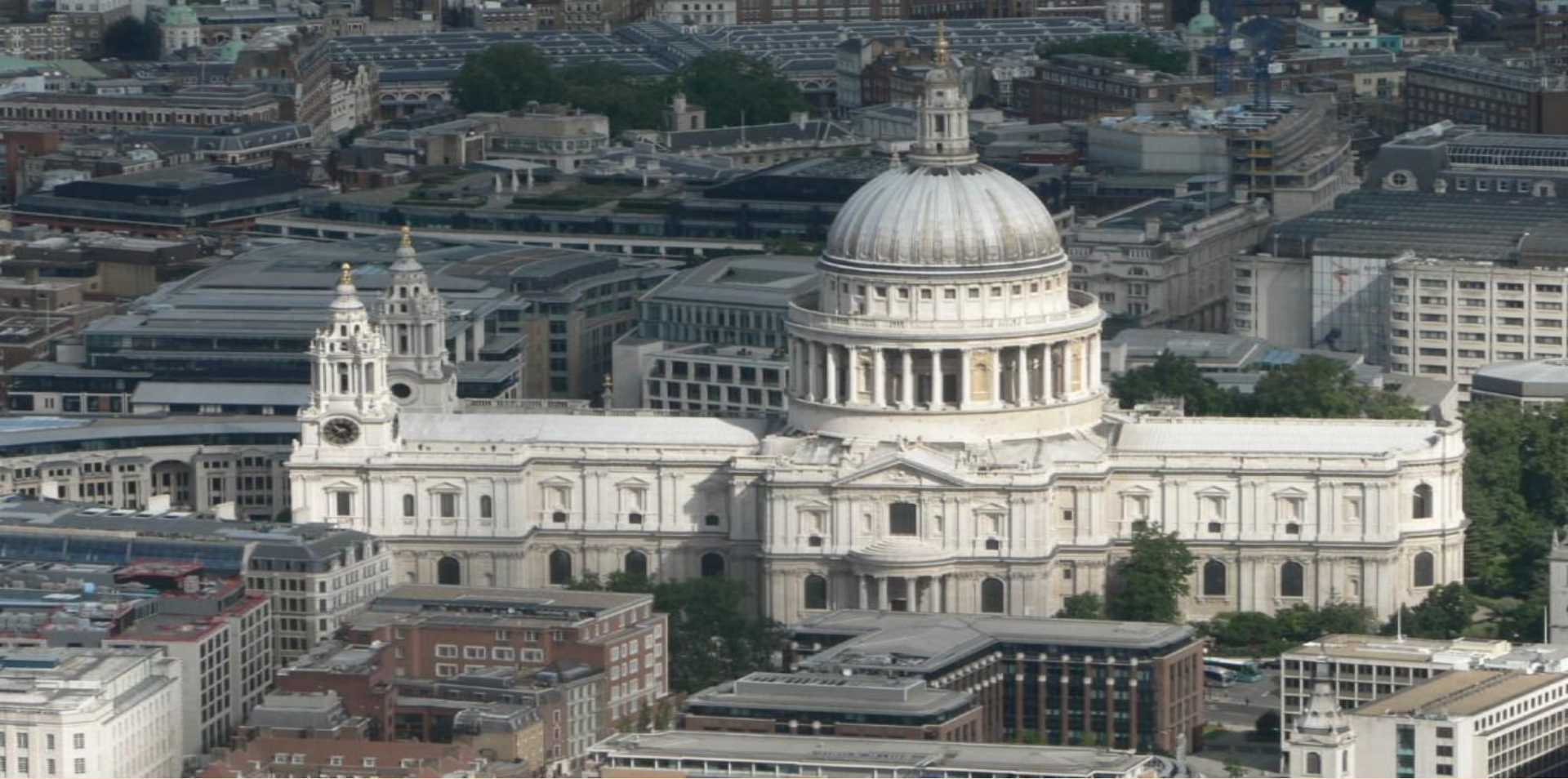
7. St. Paul's Cathedral.

It was built on the highest point of London 300 years ago. It is the London Bishop's residence and is the most popular place of visit. The price of visit is £16.