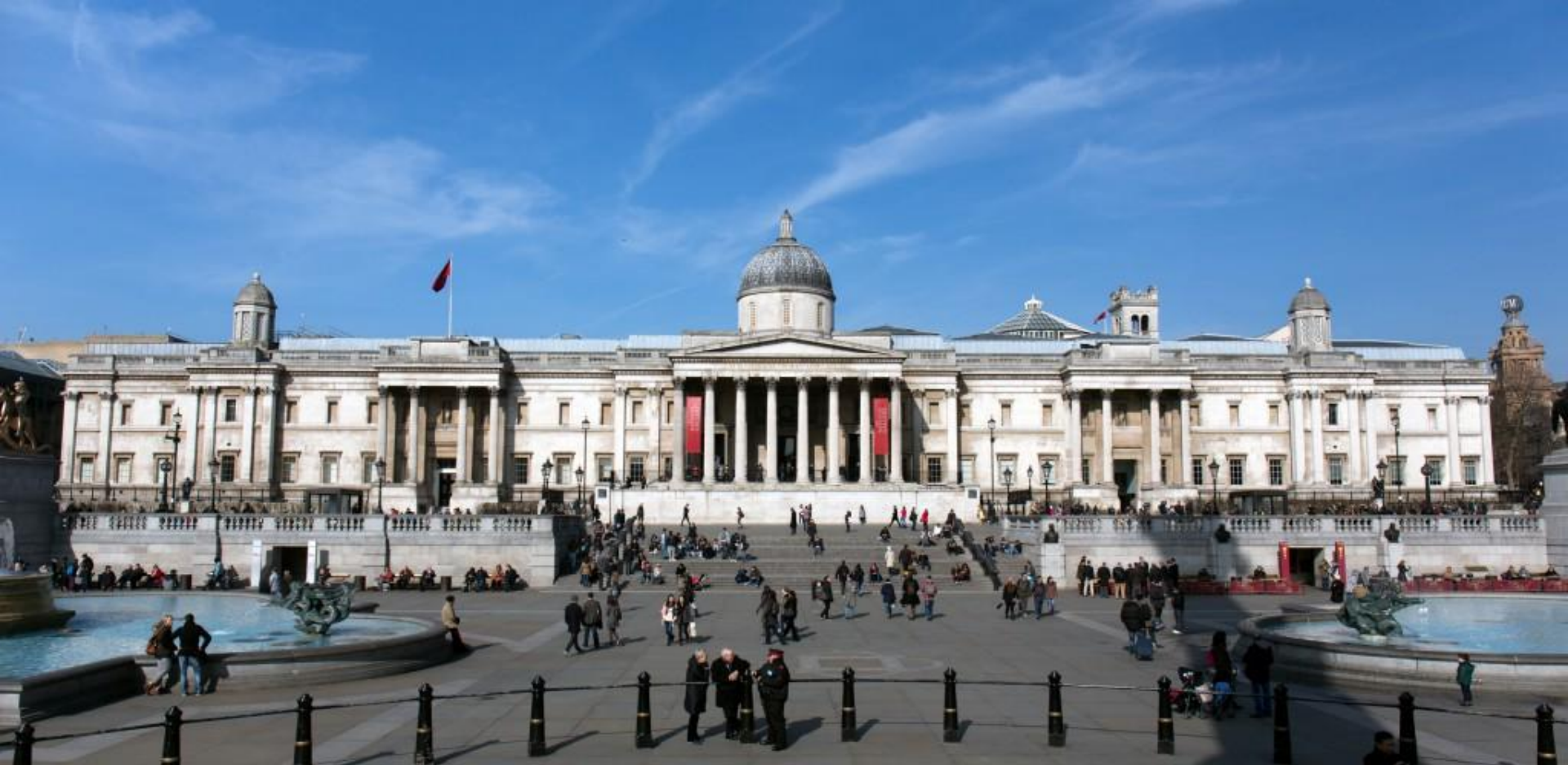
5. London National Gallery.

The gallery has more than 2000 works of world-known artists of XIII-XX centuries. You can spend the whole day there and it will not be enough. What is interesting, is that the gallery is free for everyone.