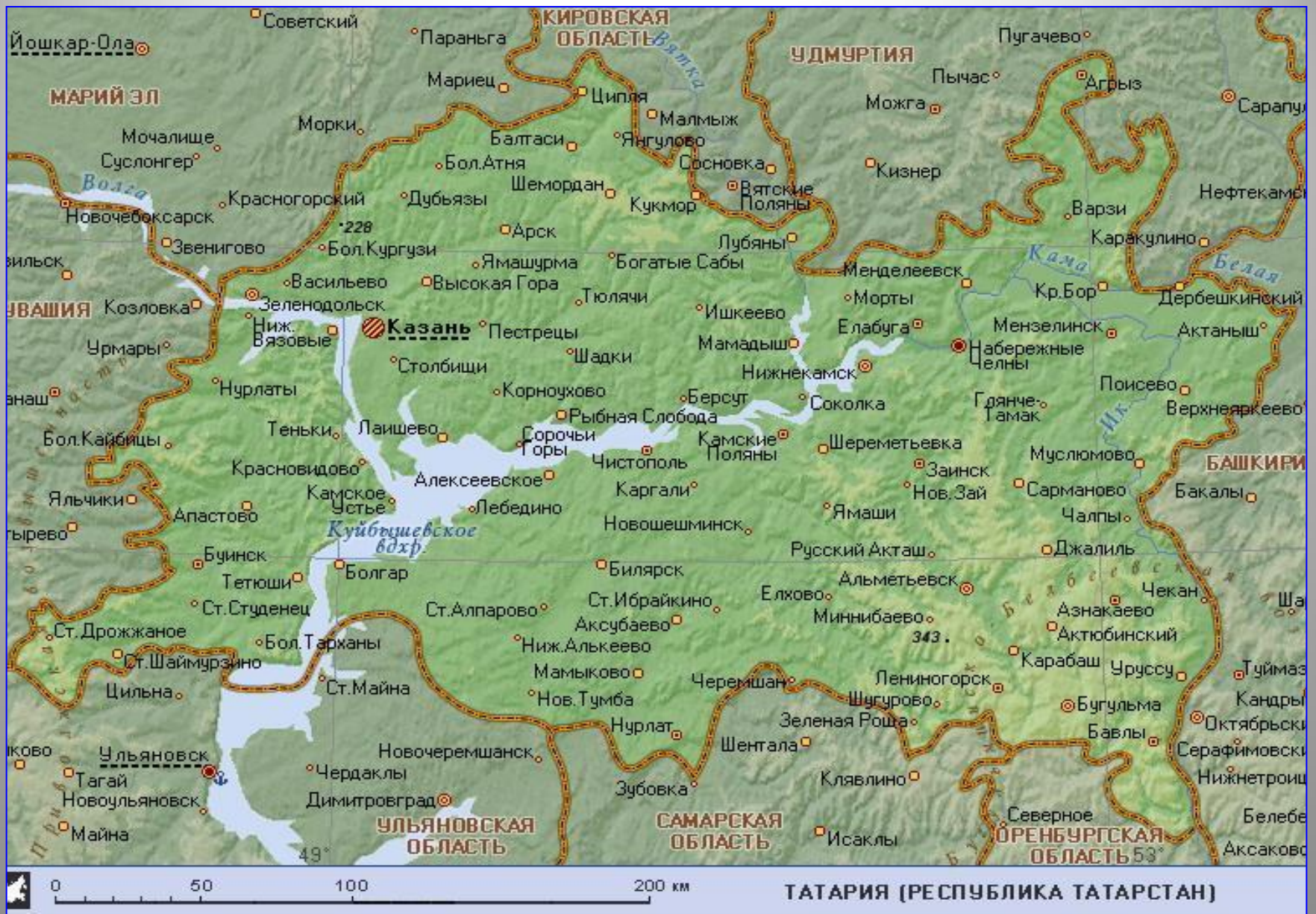
The map of Tatarstan