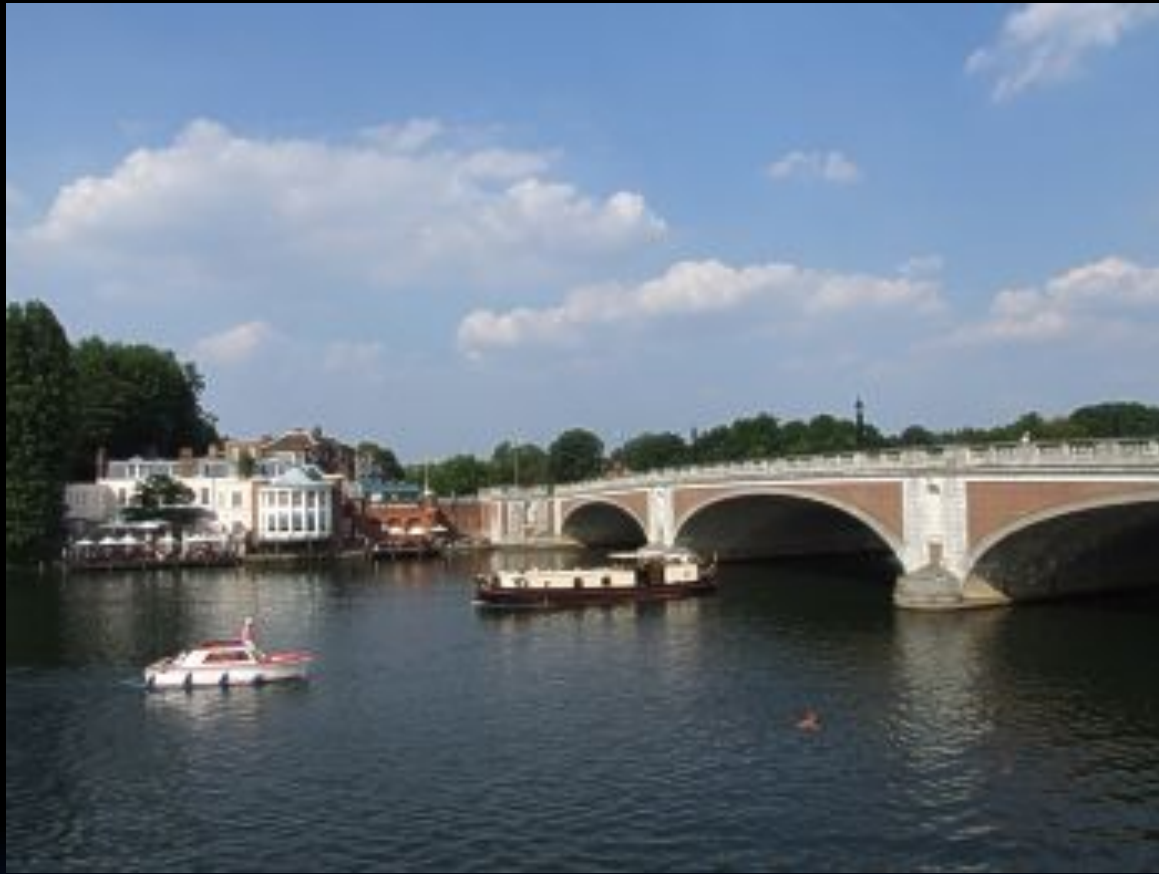
Hampton Court Bridge