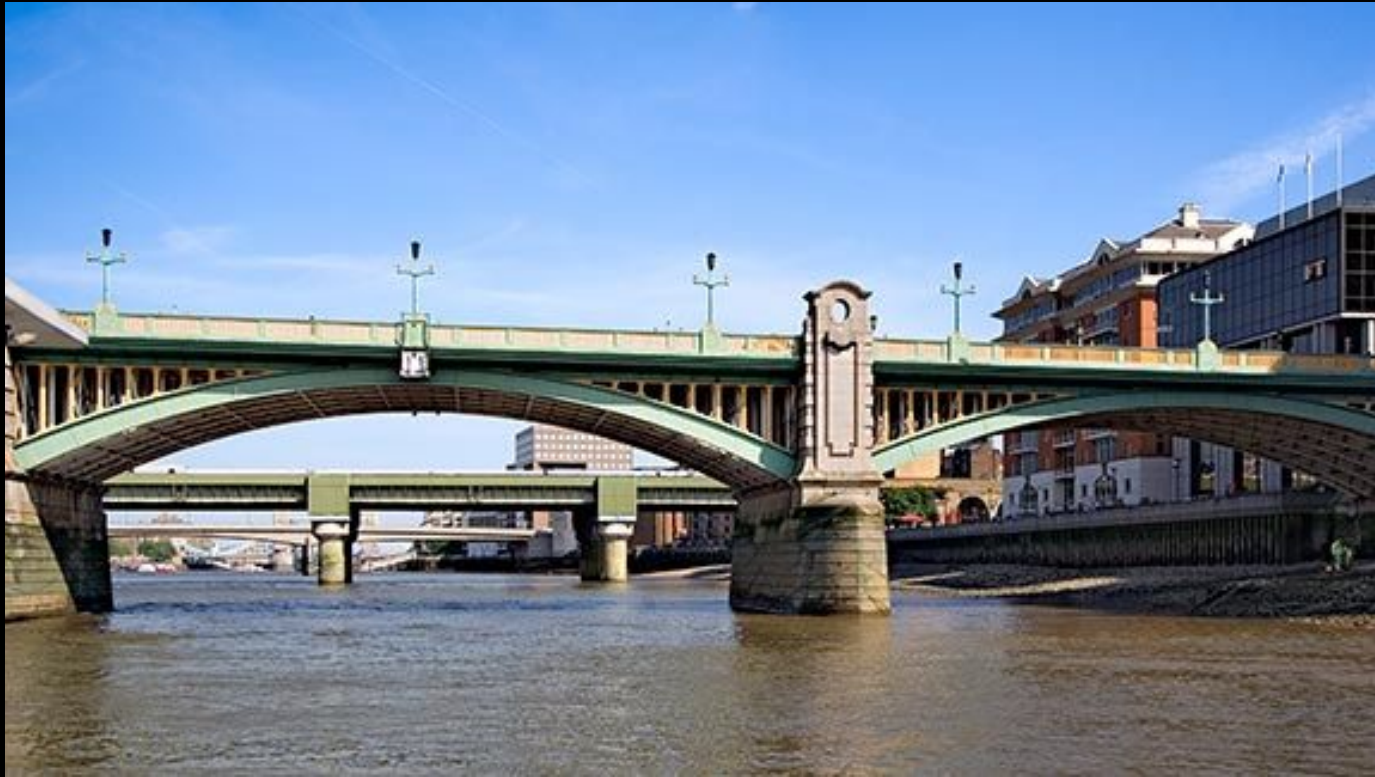
Southwark Bridge over the River Thames in London. The Cannon Street Rail Bridge and London Bridge are in the background.