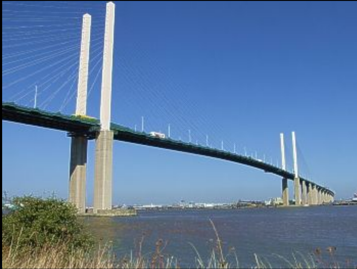
Queen Elizabeth II Bridge