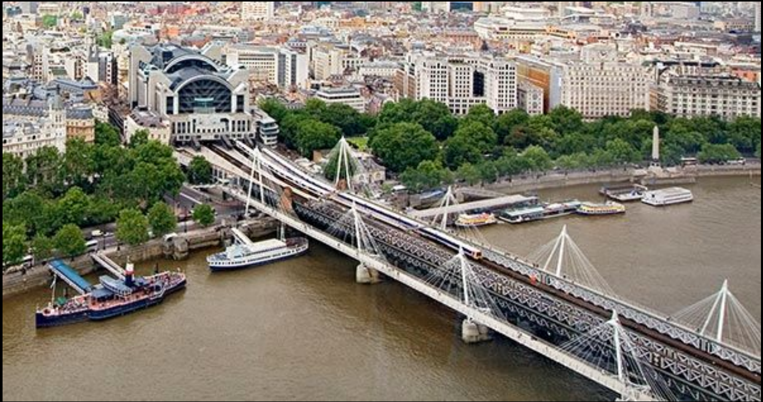
Hungerford Bridges —one railway, two pedestrian walkways—and Charring Cross Station viewed from the London Eye.