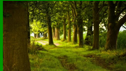
Go for walks in the woods