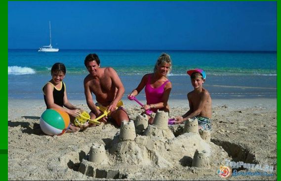
Build sand castles