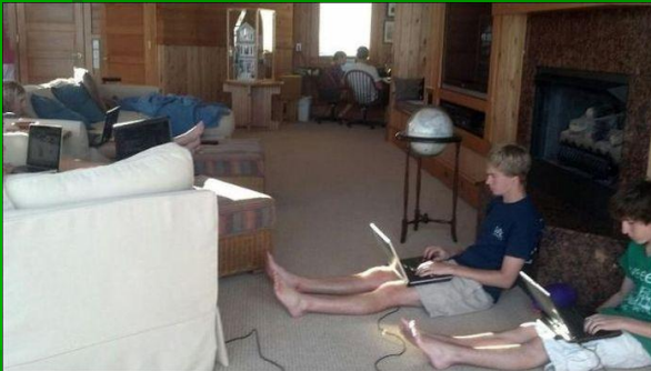
Play computer games