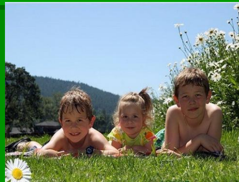
Lie on the grass