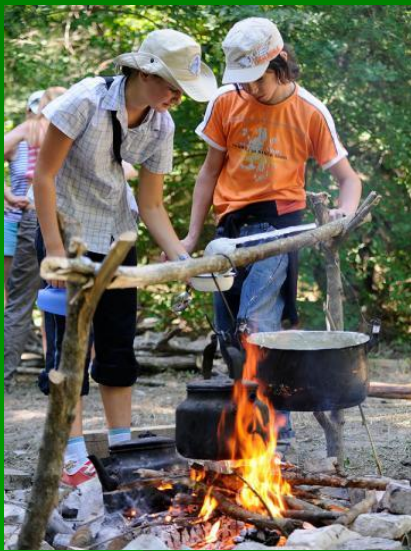
Cook food on a fire