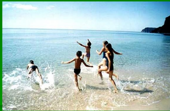
Swim in the sea