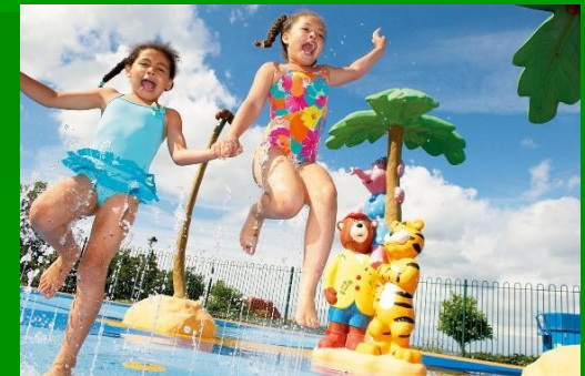
Visit a theme park