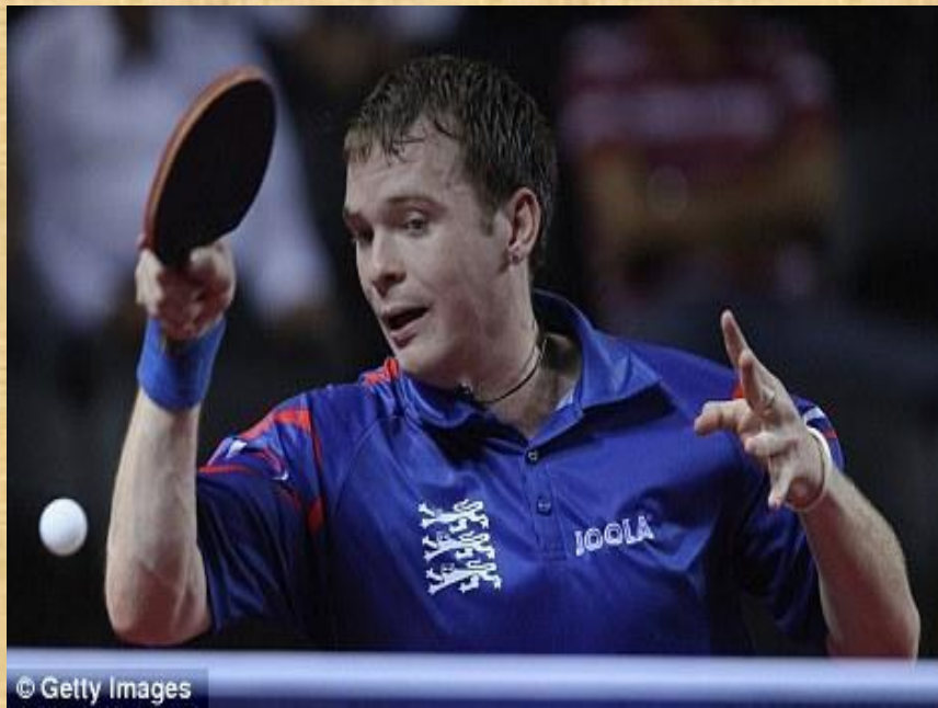
Table tennis was invented in England in 1880. It began with Cambridge University students using cigar boxes and champagne corks.

Although the game originated in England, British players don't have much luck in international championships.