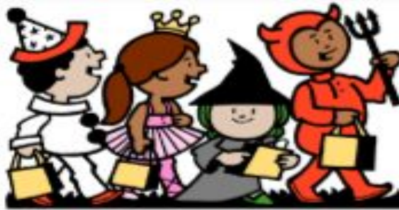
trick or treat