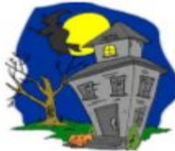
a haunted house