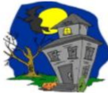
a haunted house