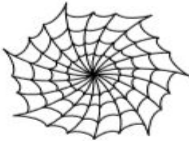
a spider web