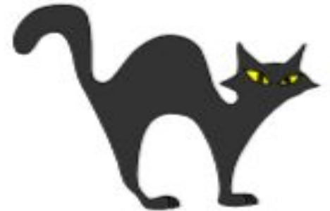
a black cat