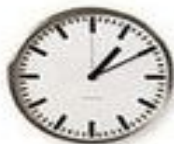
ten past one