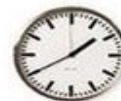
twenty to two