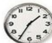
twenty five to two