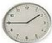
quarter to two