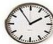
five to two