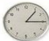
quarter past one