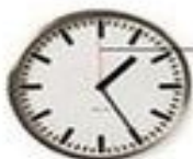
twenty five past one