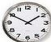
ten to two