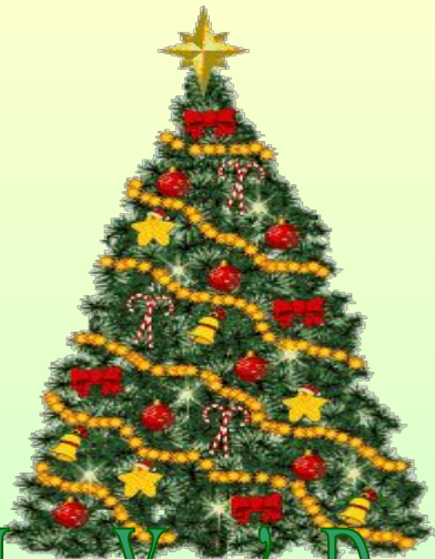
New Year's Day