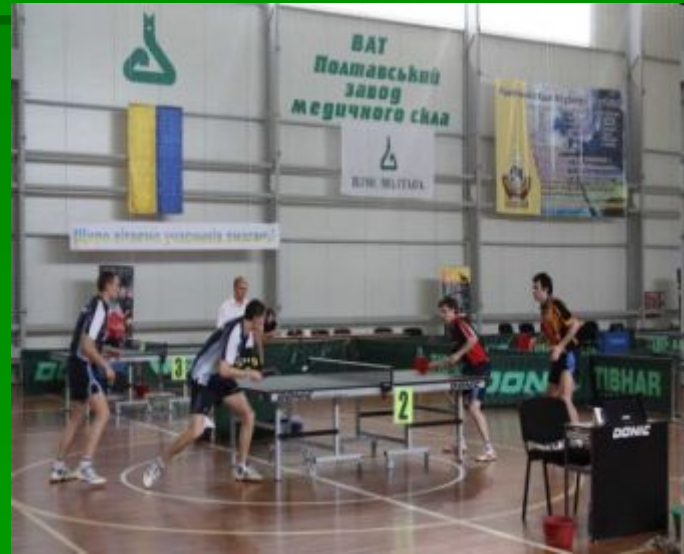
table tennis lawn tennis

Tennis is also very popular in Britain. Two different games that do not have much in common bear the name of tennis - lawn tennis and table tennis. Both games first appeared in England, but today the British prefer lawn tennis to table tennis. Every summer, in June, the biggest tournament in the world takes place at Wimbledon. This world centre of lawn tennis is located in a suburb of London. Millions of people watch the Wimbledon Championship on TV. Table tennis originated in England in 1880. But the British players are not lucky in table tennis international championships