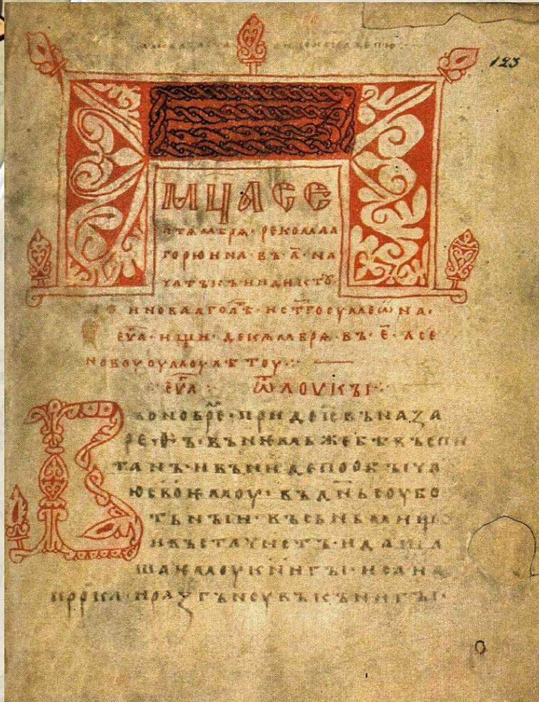
The page from Arkhangelsk Gospel (1092)

The Foundation of the Russian state library originates from the collection of N. P. Rumyantseva, who had more than 28 thousand books, 710 manuscripts, more than 1,000 maps. A year and a half after the founding of Museums, the Library Fund amounted to 100 thousand units. On 1 January, 1917 in the Library of the Rumyantsev Museum it was 1 million 200 thousand units of storage. In 2016 the funds amounted to 45 million units.