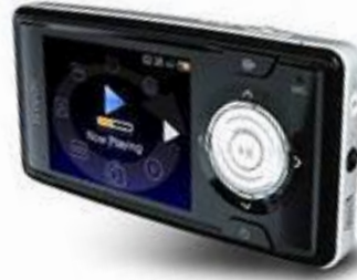
MP 3 player