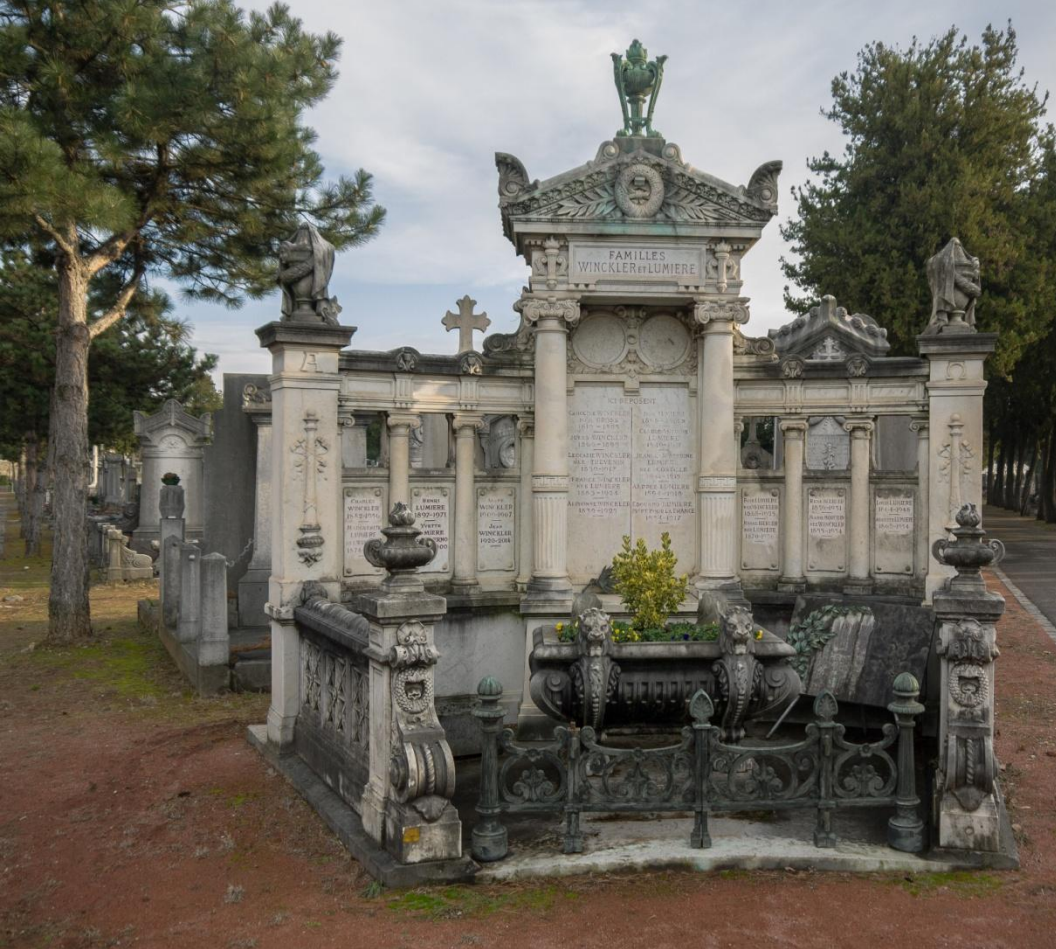
Tomb of the Lumière brothers in the New Guillotière Cemetery in Lyon

Their house in Lyon is now the Institut Lumière museum.