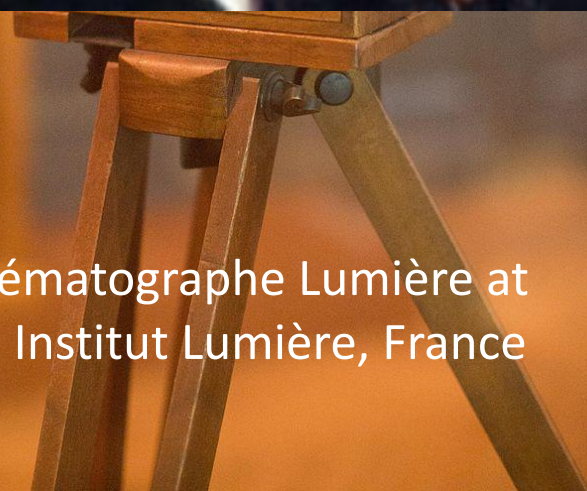
Cinématographe Lumière at the Institut Lumière, France