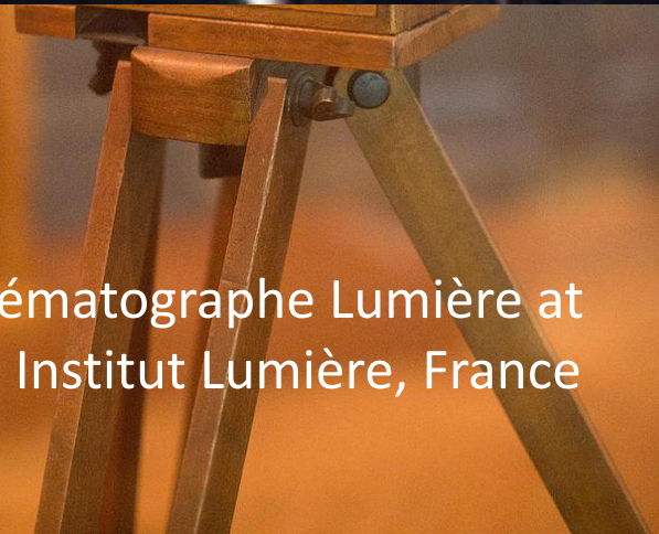
Cinématographe Lumière at the Institut Lumière, France