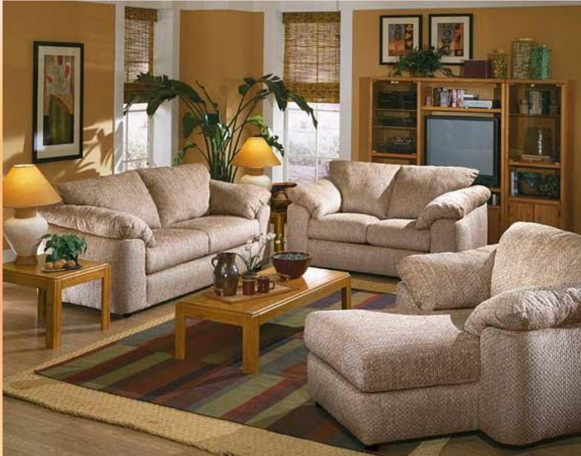
A living room

There is a TV, armchair and a sofa in this room. There is a carpet on the floor.