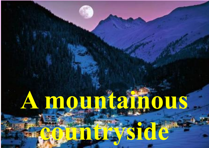
A mountainous countryside

I don't think a noisy city is a good place for a holiday.