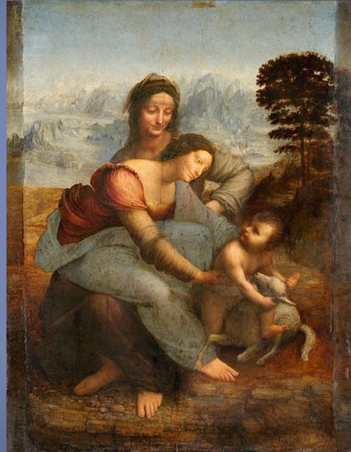
Virgin and Child with St. Anne 1508-1510