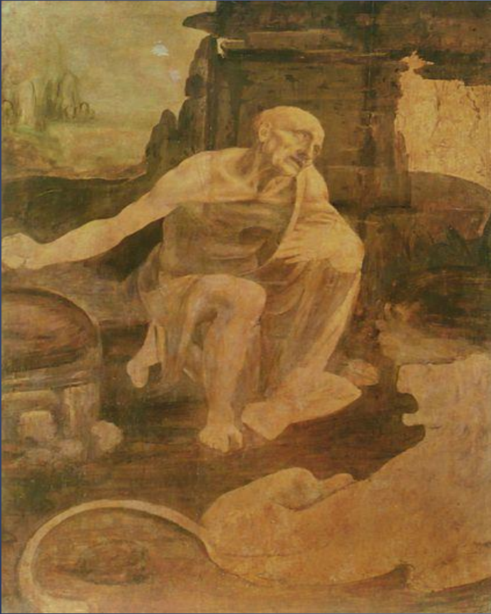
St. Jerome in the Wilderness 1480-1482