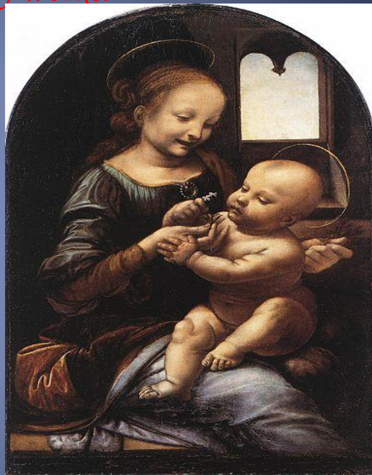
Benois Madonna 1478—1480