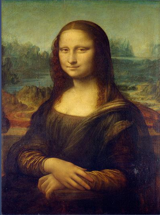
The Mona Lisa 1503—1519