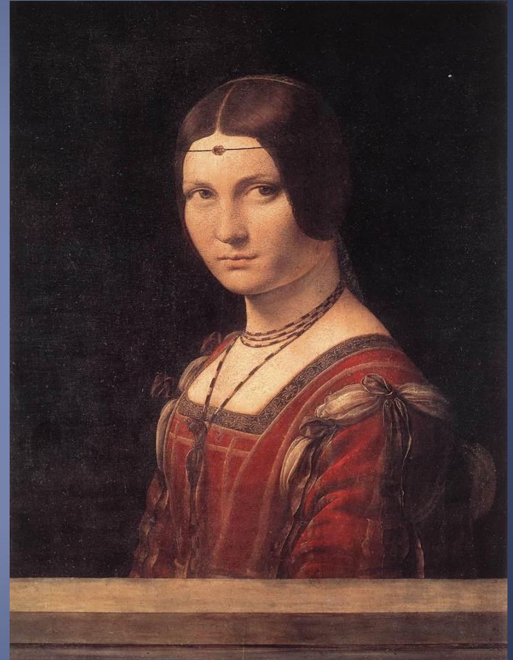
La belle Ferronière 1490-1496