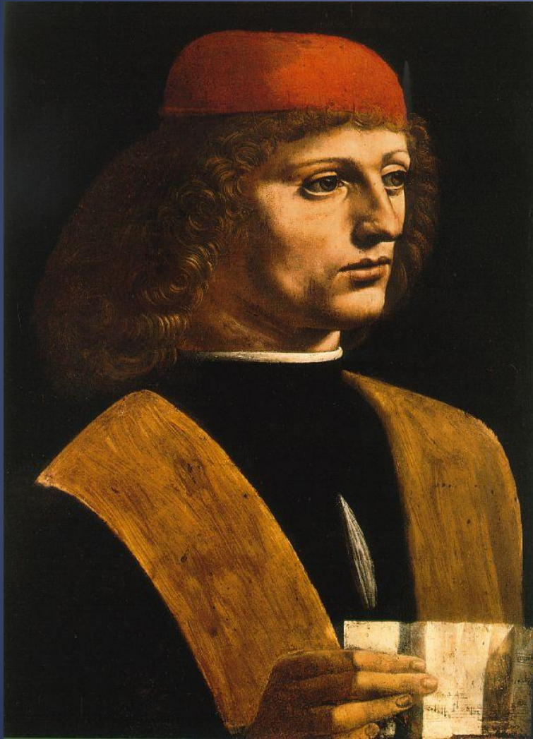
Portrait of Musician 1490—1492