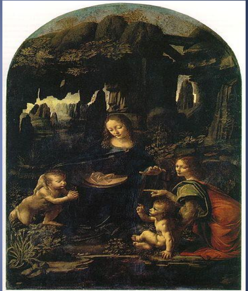
Virgin of the Rocks 1483—1486