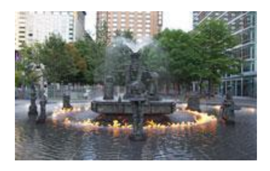
Place Jean-Paul Riopelle

Place Jean-Paul Riopelle is a small square in downtown Montreal, bordered by Montreal's convention center. The main attraction of the square is an animated fountain with a display that includes a ring of fire.