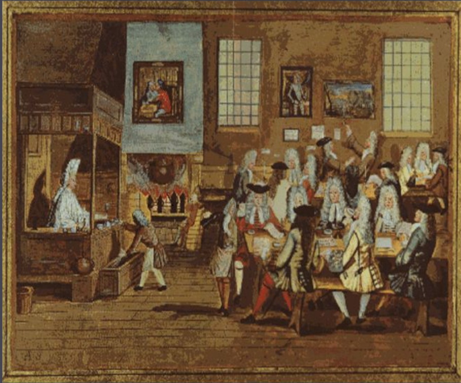
A London Coffee House of the 1660's

He often went to coffee-houses where he talked with journalists and with common people. His contributions to “The Tatler”, ”The Spectator” and other magazines show how well he understood the spirit of the time.