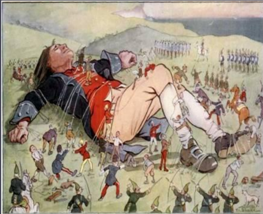
HE FOUND THAT HIS ARMS AND LEGS WERE TIGHTLY FASTENED TO THE GROUND.

After being ship-wrecked, Gulliver gets safely ashore and finds himself in a strange country inhabited by a race of people about six inches high.