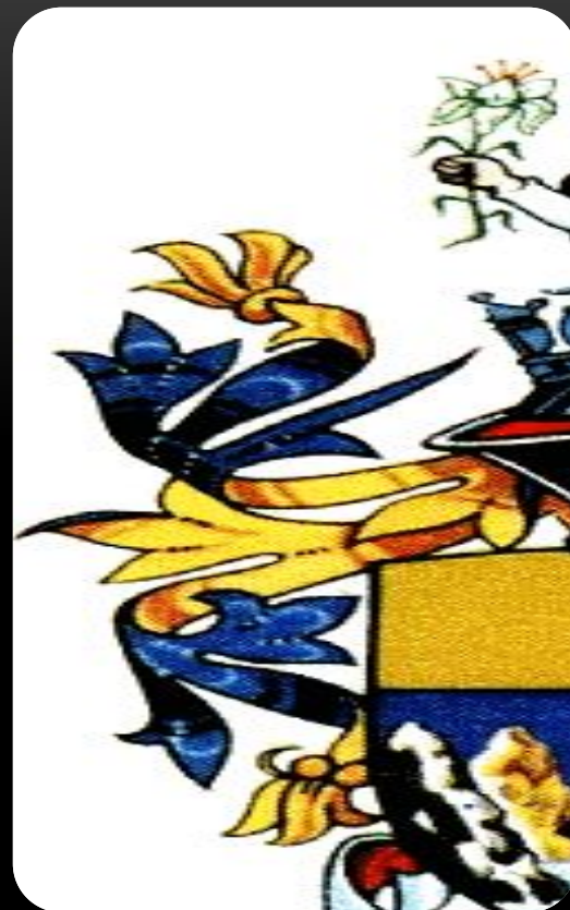
St. Helena island