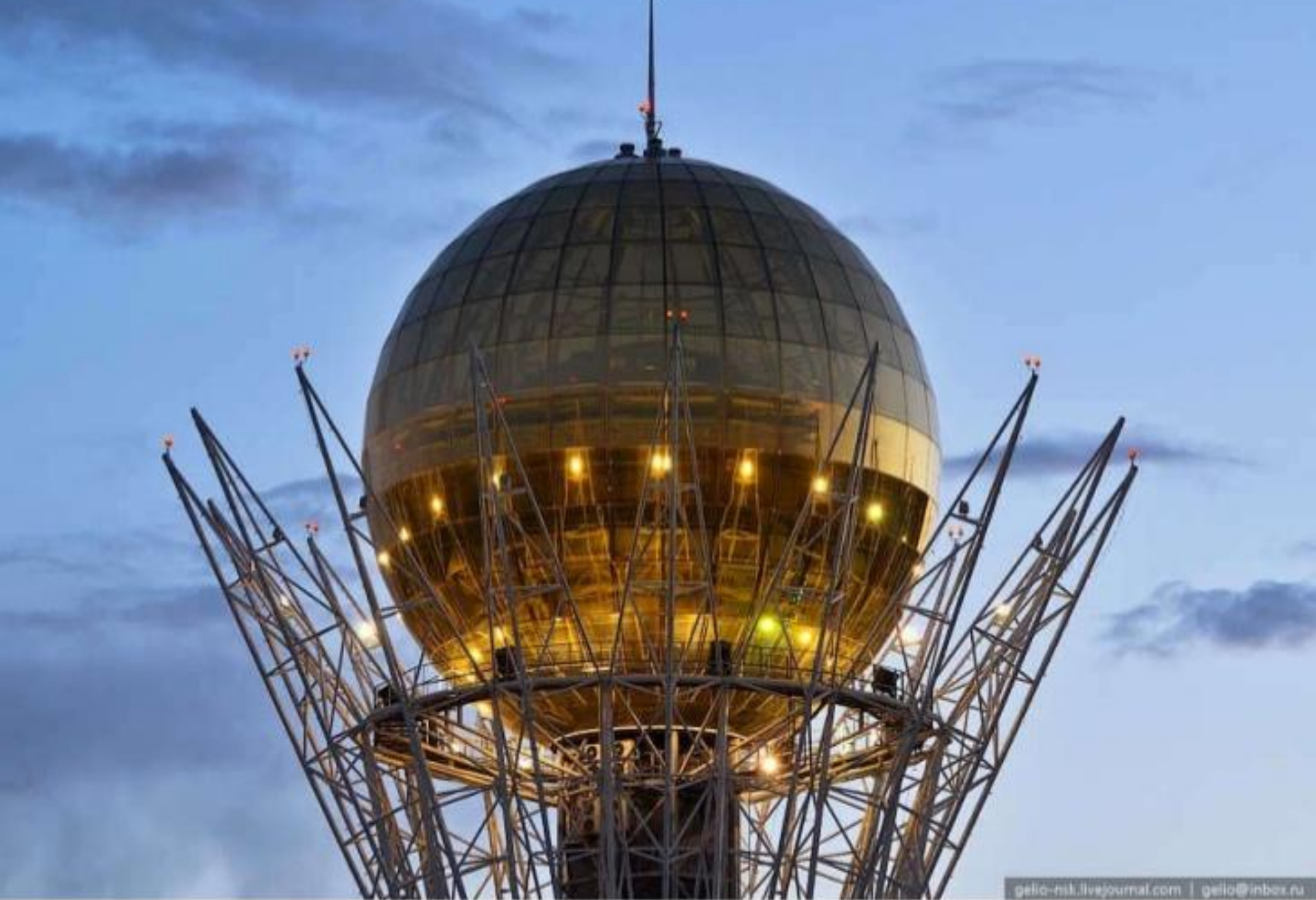
Baiterek - a monument in the center of Astana. - Built on the sketches of the British architect Norman Foster. At the top level "ball", within which is a bar and a panoramic room.