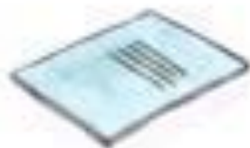
an exercise book