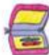
a pencil case