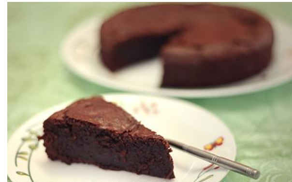
A PIECE OF CAKE