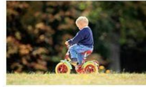
Ride a bike