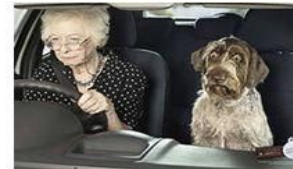
Drive a car