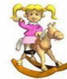
Ride a horse