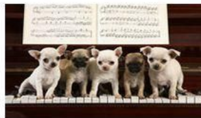
Play the piano

Look at the pictures and say, what you CAN or CAN'T do. Посмотри на картинки и скажи, что ты умеешь и что не умеешь делать.