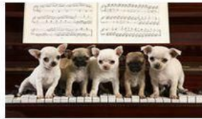
Play the piano

Look at the pictures and say, what you CAN or CAN'T do. Посмотри на картинки и скажи, что ты умеешь и что не умеешь делать.