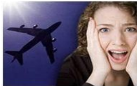
Fly the plane