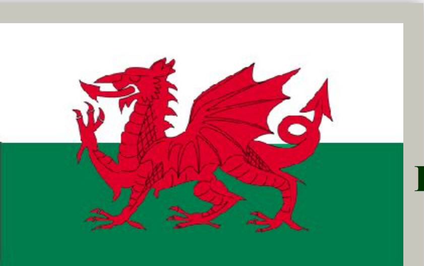
Flag of Wales

St David - Dewi Sant was a Celtic monk, abbot and bishop, who lived in the sixth century. He spread the word of Christianity across Wales