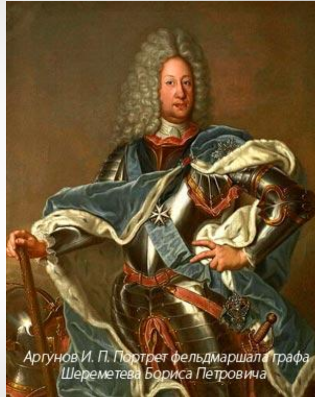
Аргунов И. П. Портрет фельдмаршала графа Шереметева Бориса Петровича