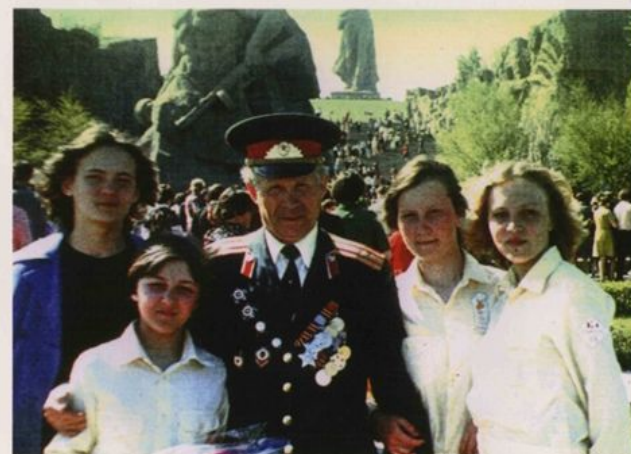
Команда школы №6 г.Лениногорска. Победители всесоюзного похода