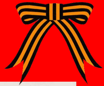
Кабинет школы №6 - филиал школьного музея