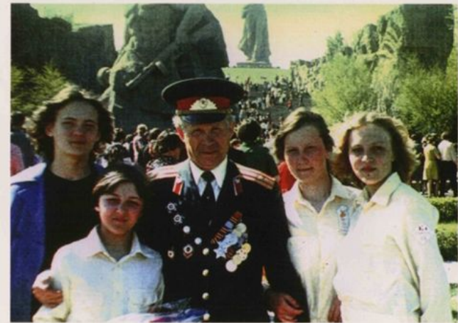
Команда школы №6 г.Лениногорска. Победители всесоюзного похода