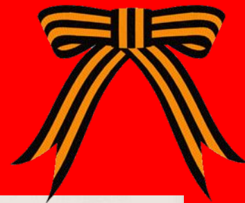
Кабинет школы №6 - филиал школьного музея