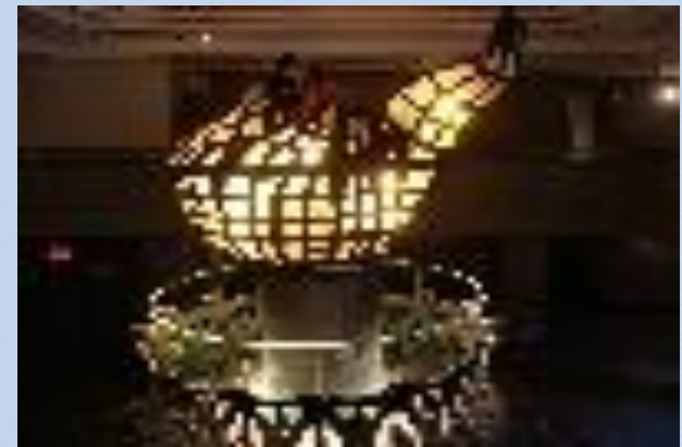
Original Torch of Statue of Liberty