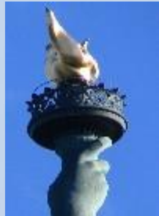
Current torch of Statue of Liberty