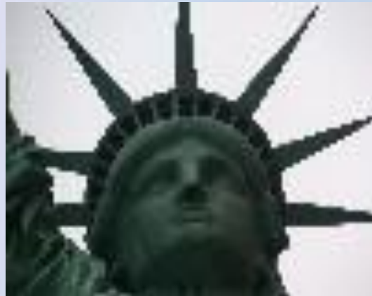
Liberty Face and Crown