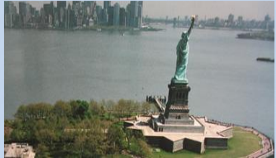
Liberty Enlightening the World