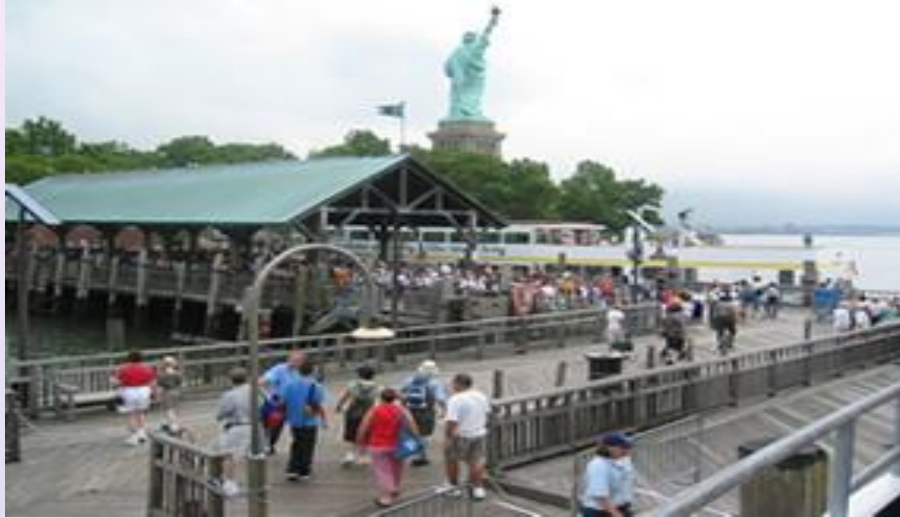
Ferry Dock at Liberty Island