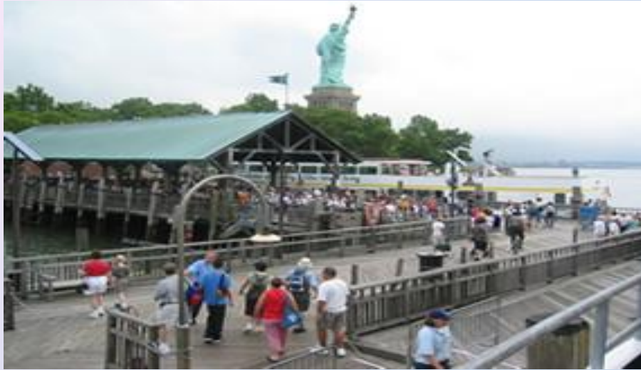
Ferry Dock at Liberty Island