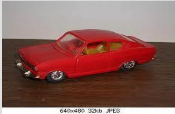
640x480 32kb JPEG