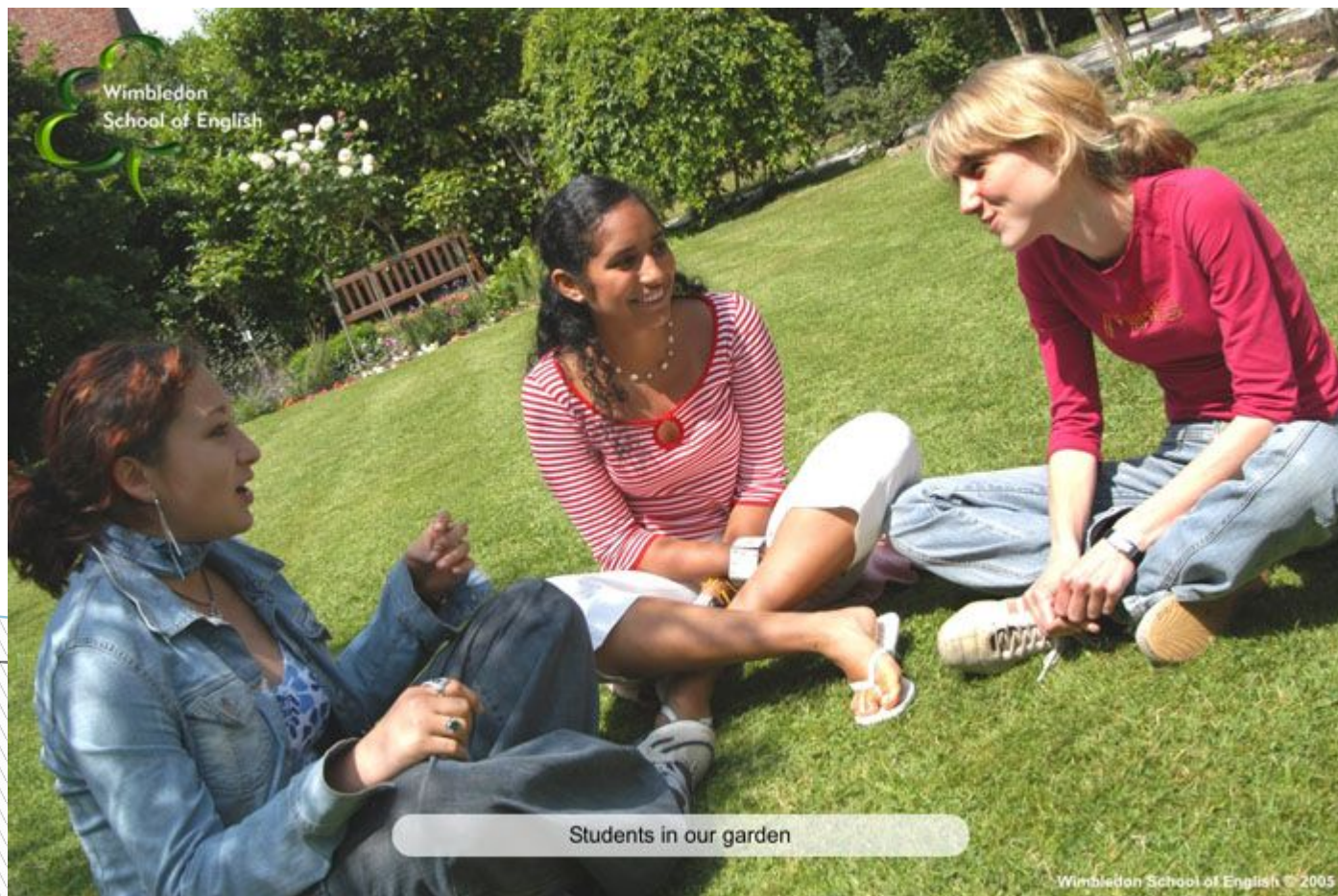
Students in our garden