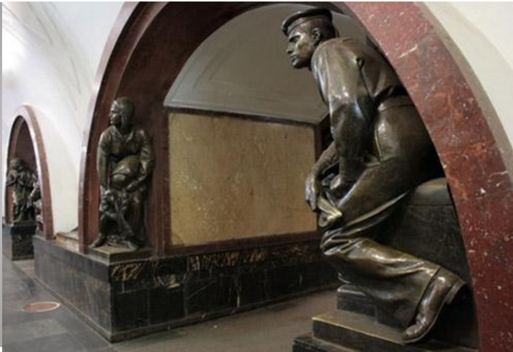
Площадь революции - станция метро-