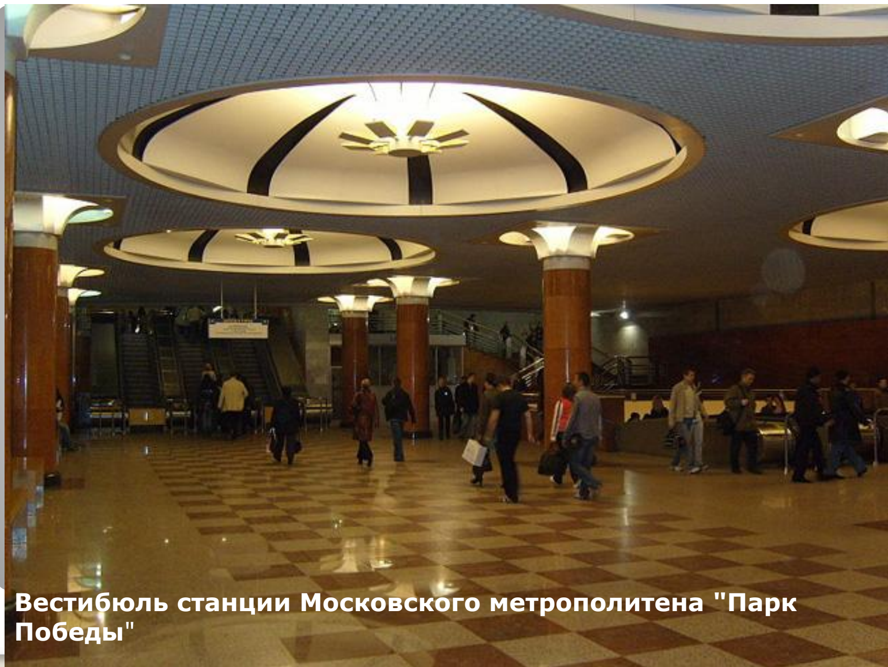
Вестибюль станции Московского метрополитена "Парк Победы"