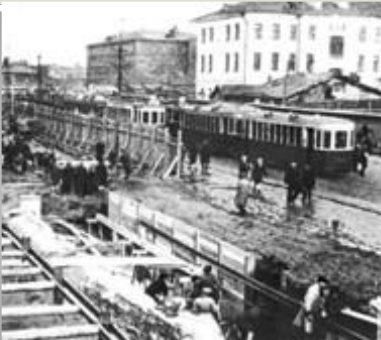
СТРОИТЕЛЬСТВО ПЕРВОЙ ЛИНИИ МЕТРО