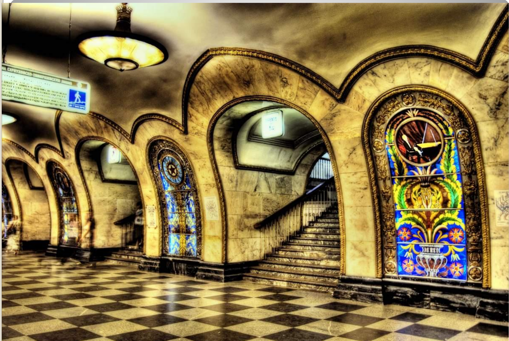
станция метро "Новослободская"