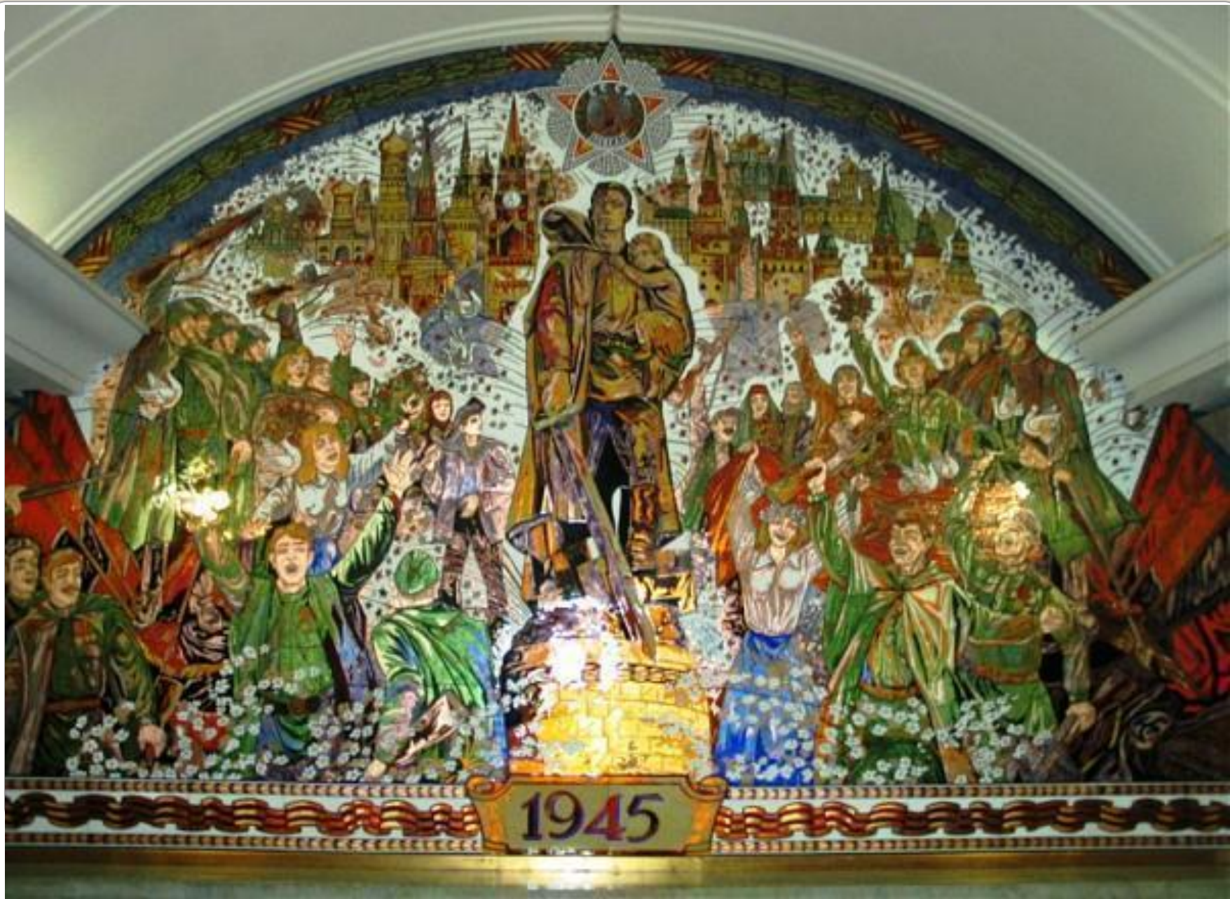
Станция метро "Парк Победы" - Москва