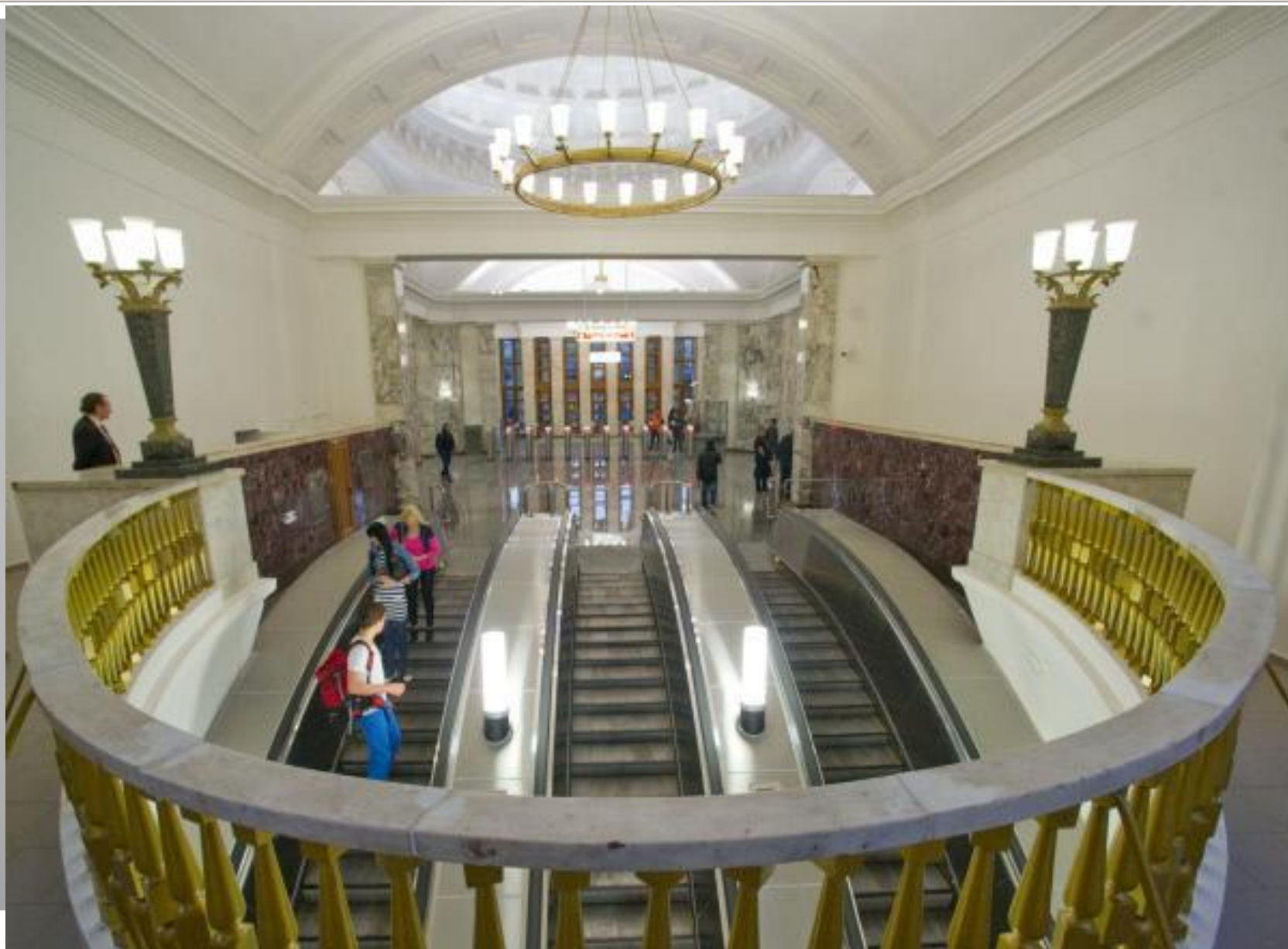
Вестибюль станции метро "Парк культуры-кольцевая" в Москве