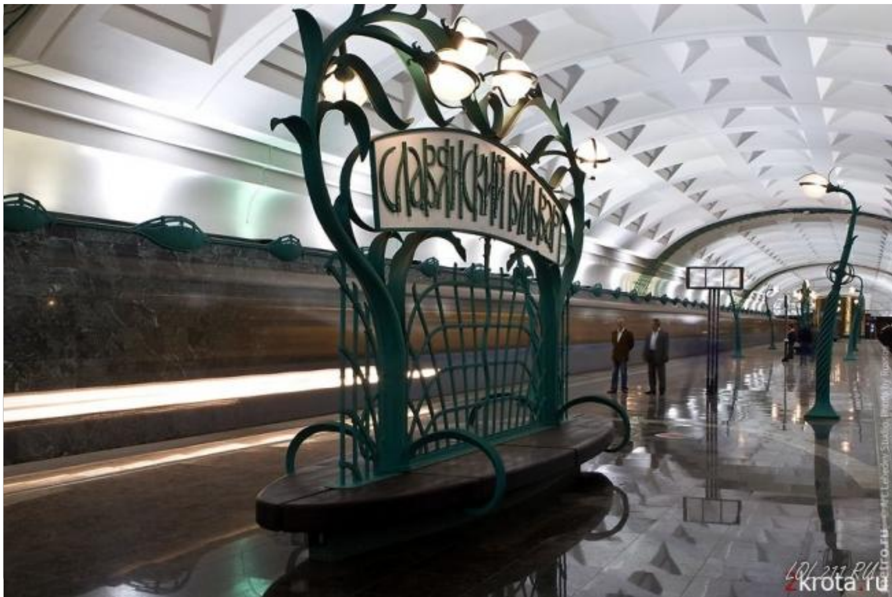
Славянский бульвар - новая станция московского метро