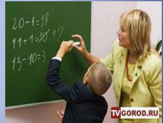
№6 discuss problems