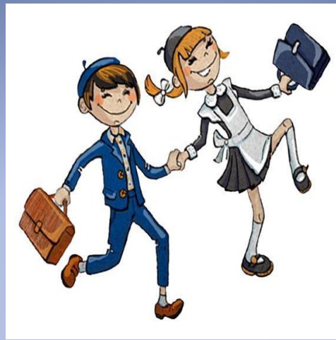
№2 run between the desks