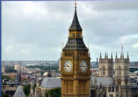
4. Big Ben