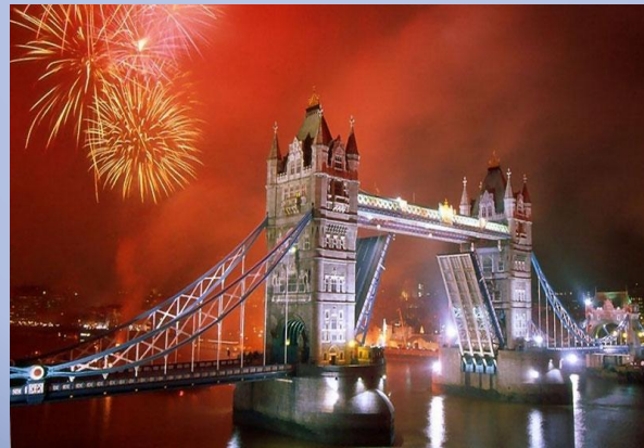
5. Tower Bridge