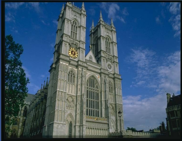
1. Westminster Abbey