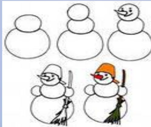
№5 draw pictures