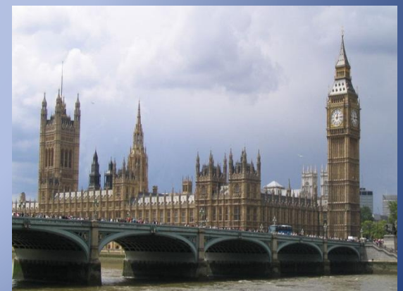
6. The houses of parliament