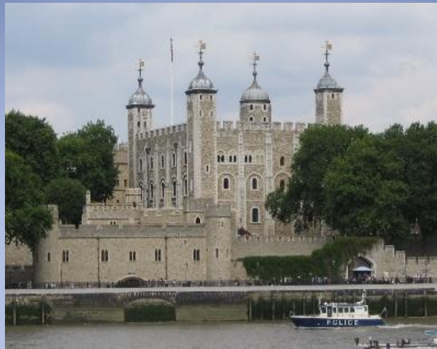
2. The Tower of London