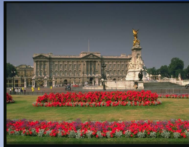
3. Buckingham Palace