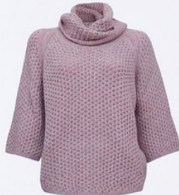
SWEATER ['swetə] свитер