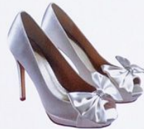
SHOES [ʃu:z] туфли