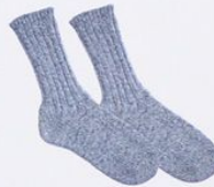
SOCKS [sɒks] носки