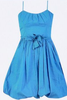
DRESS [dres] платье