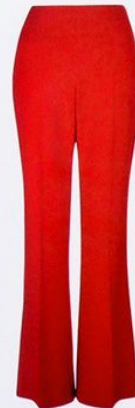
TROUSERS ['traʊzəz] брюки