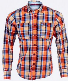
SHIRT [ʃɜ:t] рубашка