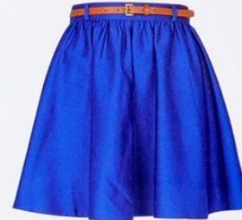
SKIRT [skɜ:t] юбка