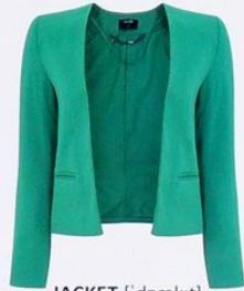
JACKET ['dʒækɪt] жакет/куртка