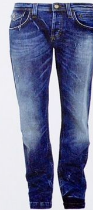
JEANS [dʒi:nz] джинсы