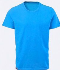
T-SHIRT [tɪ ʃɜ:t] футболка