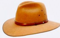
HAT [hæt] шляпа