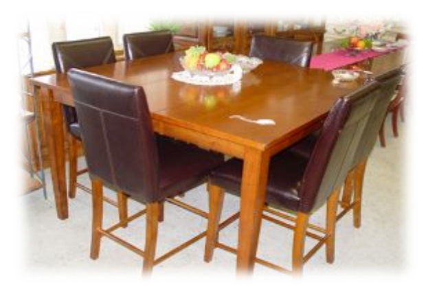
table & chairs