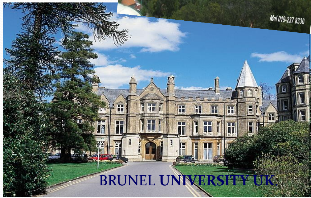
BRUNEL UNIVERSITY UK