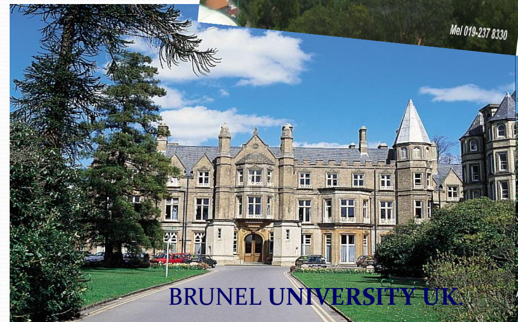
BRUNEL UNIVERSITY UK