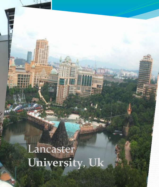
Lancaster University, Uk