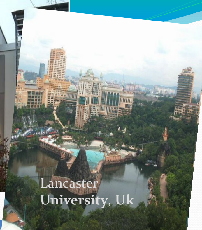
Lancaster University, Uk