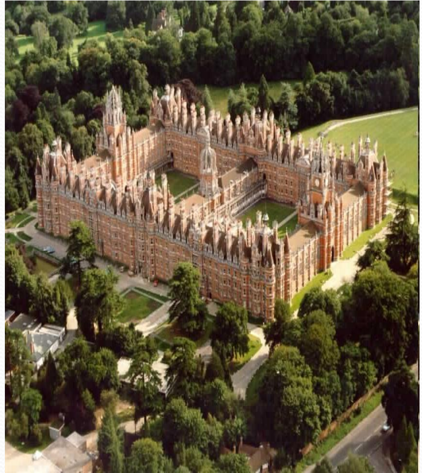
University of London.

Following two years of study, students may take A-Level (short for Advanced Level) examinations, which are required for university entrance in the UK.