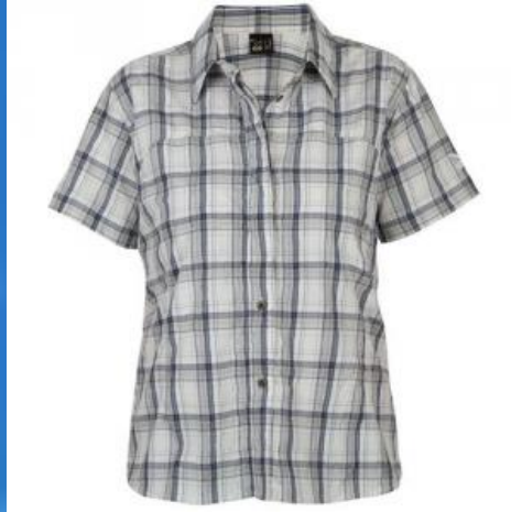
SH _ _ T