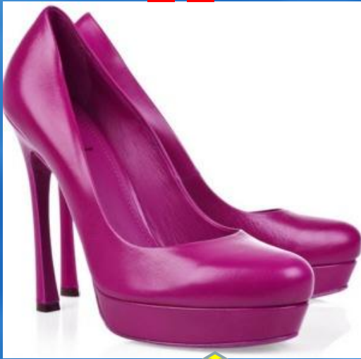
SH _ _ S