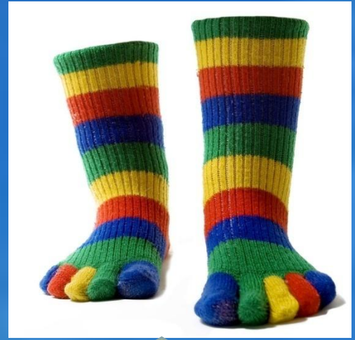
SO _ _ S