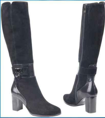
B _ _ TS