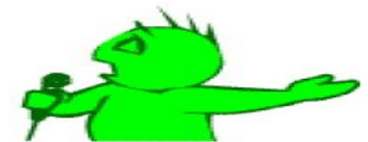
He is singing.