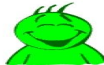
He is smiling.