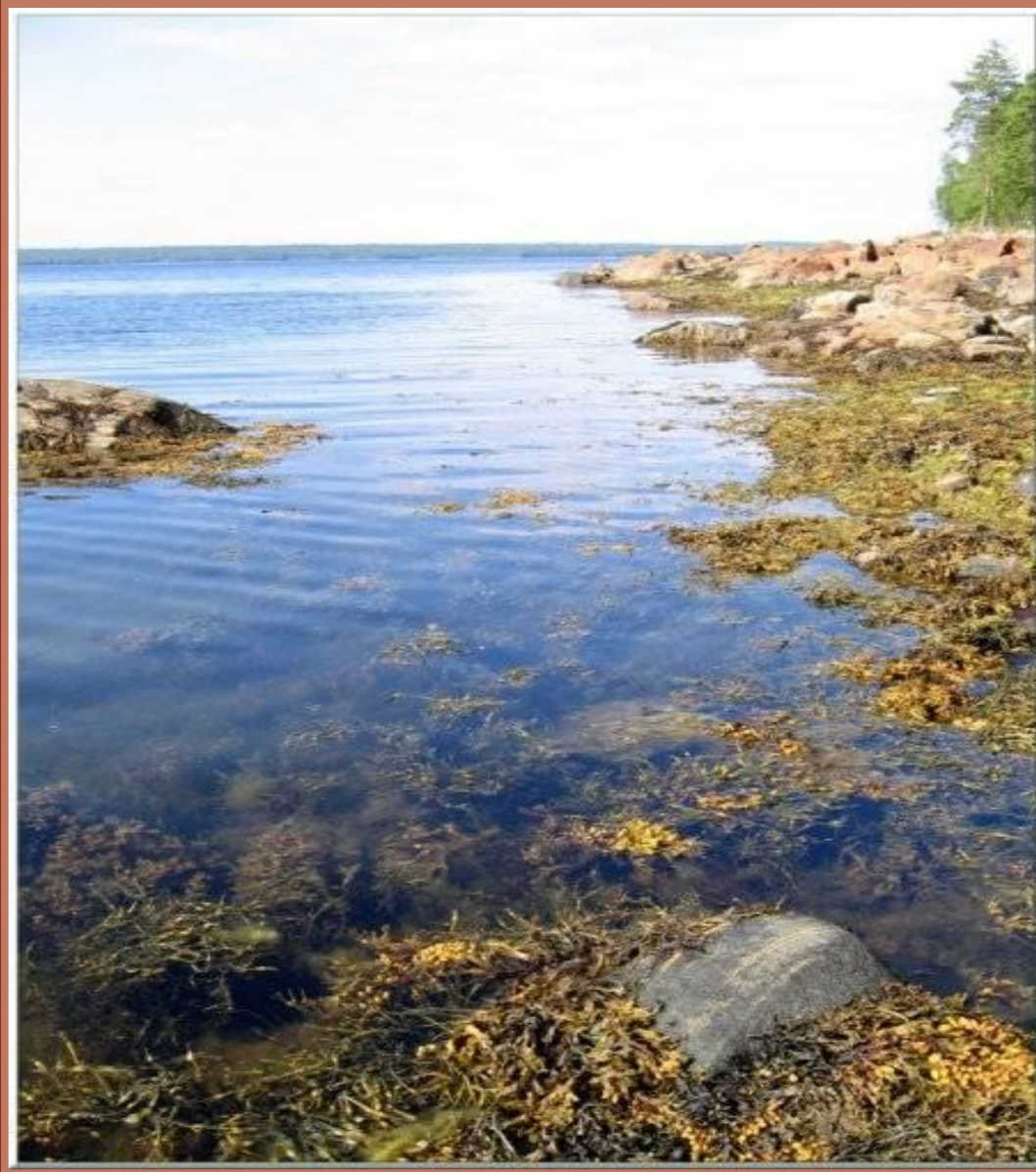
The White Sea