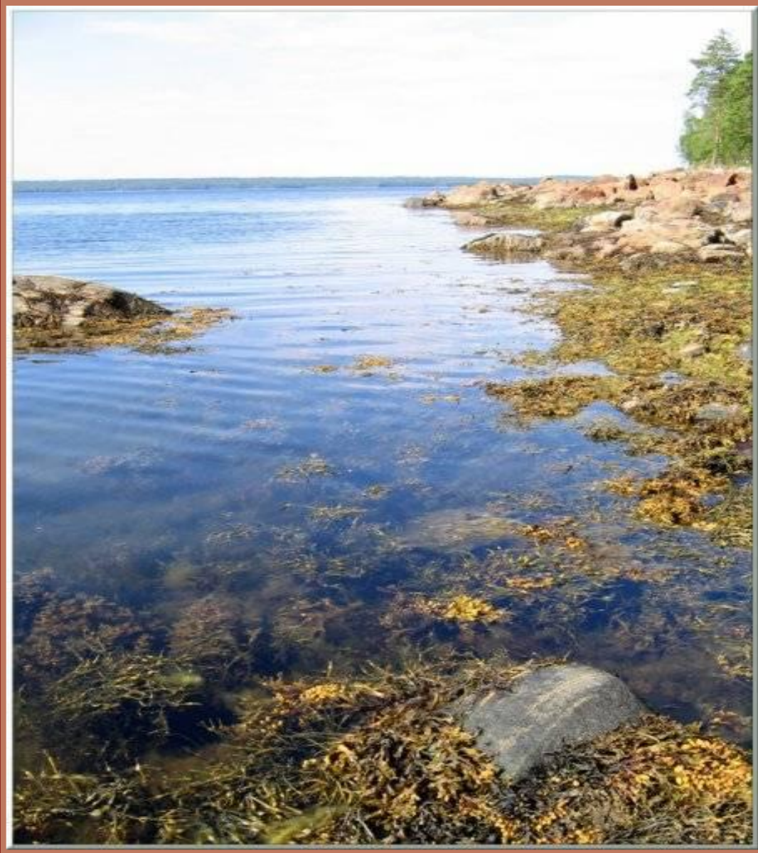
The White Sea