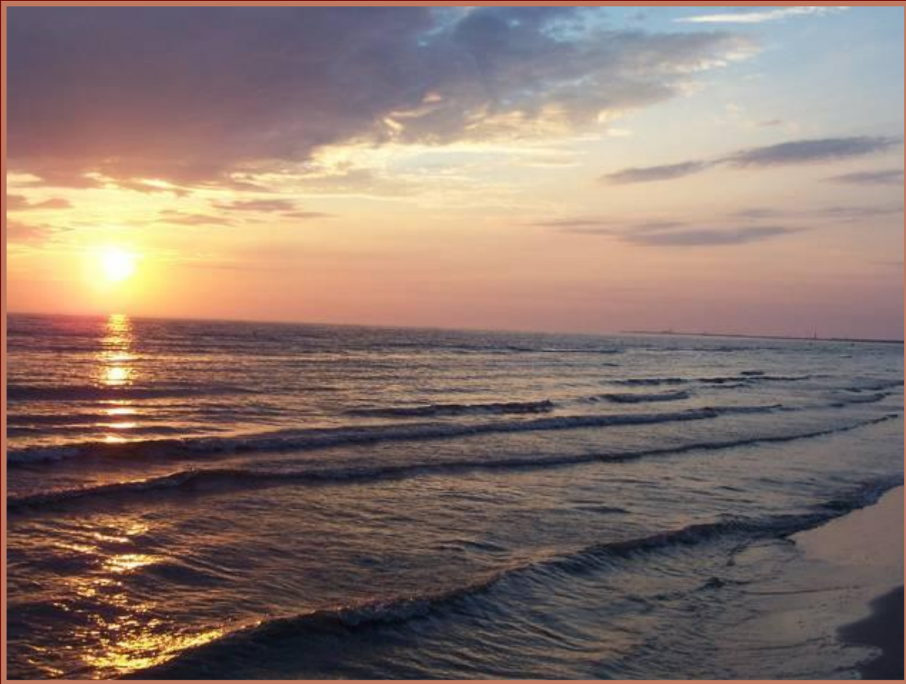
The Baltic Sea

Seas and oceans wash Russia in the north, south, east and west. The Black Sea is in the South; the Baltic Sea is in the West