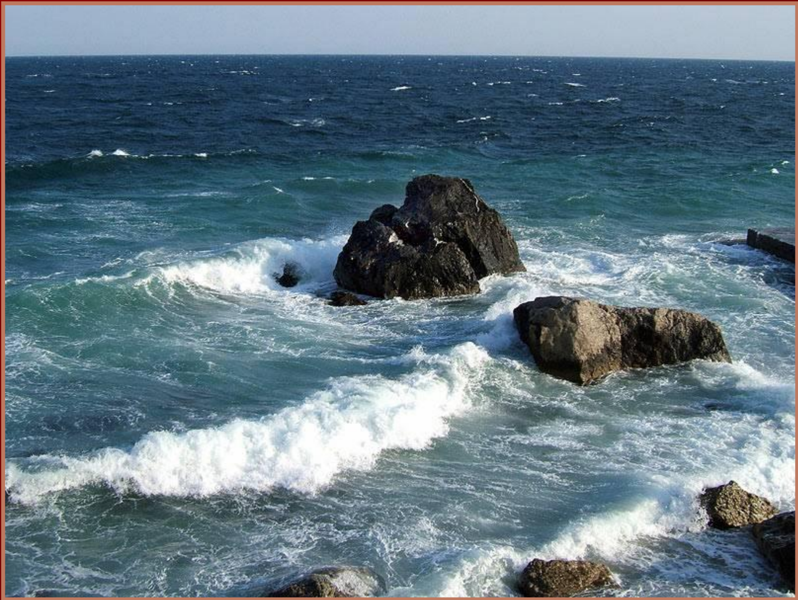
The Black Sea