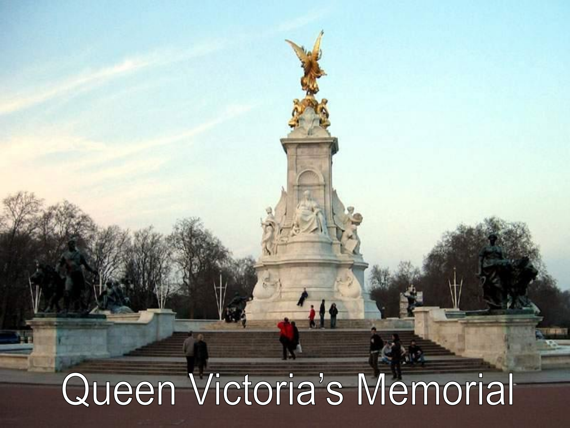
Queen Victoria's Memorial