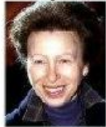
Princess Anne b. 15 Aug 1950

Married 14 Nov 1973 Divorced 28 Apr 1992