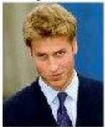
Prince William b. 21 Jun 1982