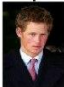
Prince Henry (Harry) b. 15 Sep 1984