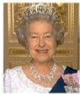
HM Queen Elizabeth II b. 21 Apr 1926