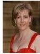
Sophie Countess of Wessex b. 20 Jan 1965