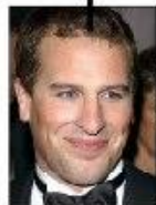
Peter Phillips b. 15 Nov 1977