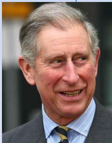
Charles, Prince of Wales b. 1948