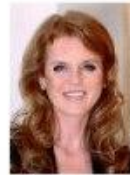
Sarah Duchess of York b. 15 Oct 1959

Married 23 Jul 1986 Divorced 30 May 1996