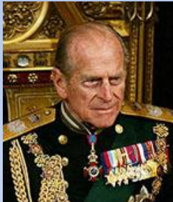
Prince Phillip, Duke of Edinburgh b. 1921