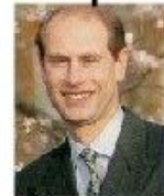
Prince Edward Earl of Wessex b. 10 Mar 1964