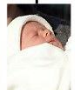
Viscount Severn b. 17 Dec 2007