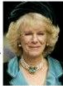
Camilla Duchess of Cornwall b. 17 July 1947