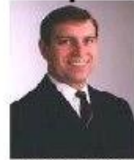
Prince Andrew Duke of York b. 19 Feb 1960

Married 23 Jul 1986 Divorced 30 May 1996