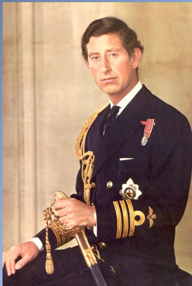
Charles, the Prince of Wales