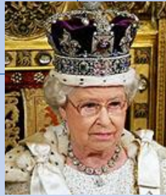
ELIZABETH II b. 1926