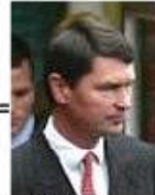
Timothy Laurence b. 1 Mar 1955