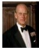
Prince Philip Duke of Edinburgh b. 10 Jun 1921