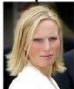
Zara Phillips b. 15 May 1981