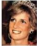
Diana Princess of Wales b. 1 Jul 1961 d. 31 Aug 1997

Married 29 Jul 1981 Divorced 28 Aug 1996