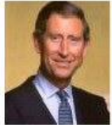
Prince Charles Prince of Wales b. 14 Nov 1948