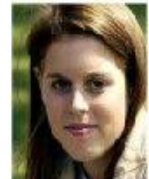
Princess Beatrice b. 8 Aug 1988