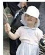
Lady Louise b. 8 Nov 2003