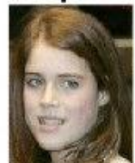
Princess Eugenie b. 23 Mar 1990