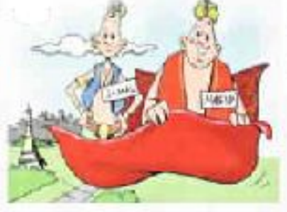
travel to France