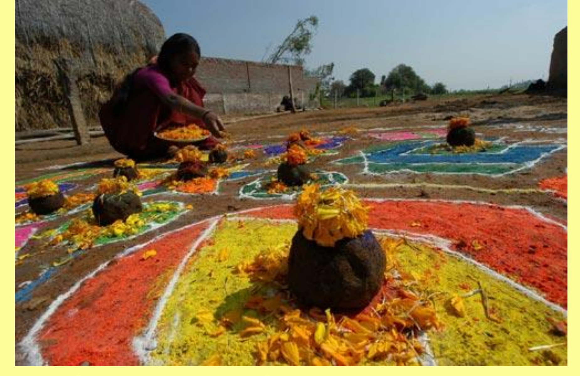
The festival lasts five days. And there are a lot of interesting events.