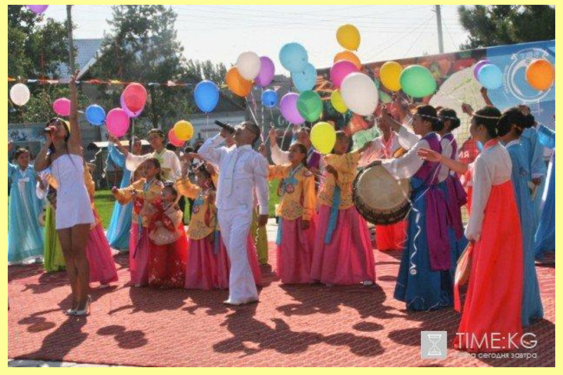
People have a great time and a lot of fun.