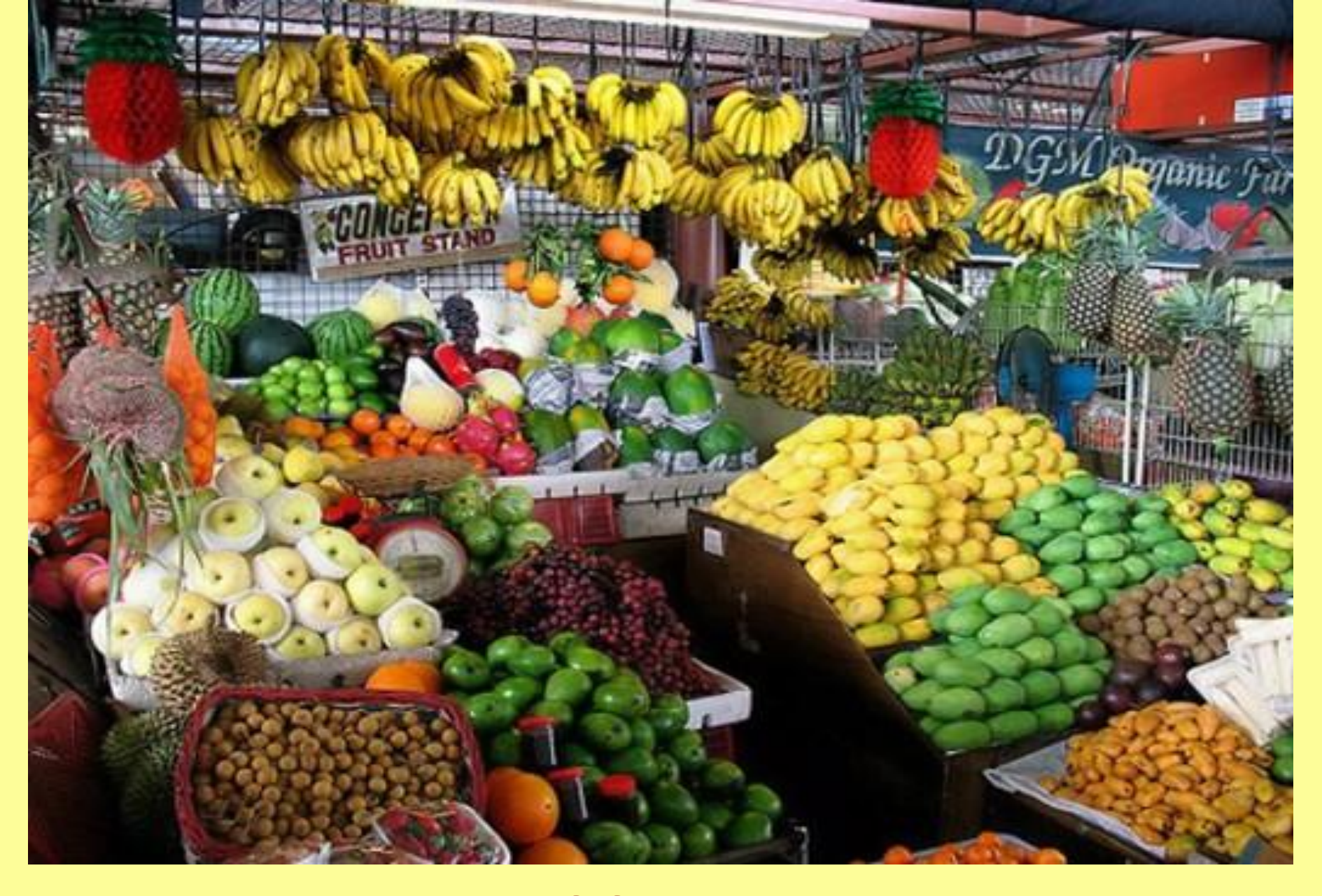
There are a lot of fruits in the markets.