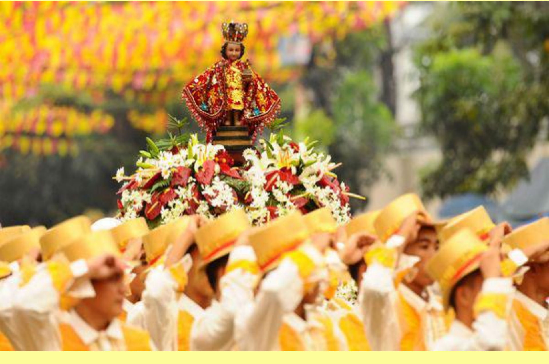
Many tourists come to watch the festival.