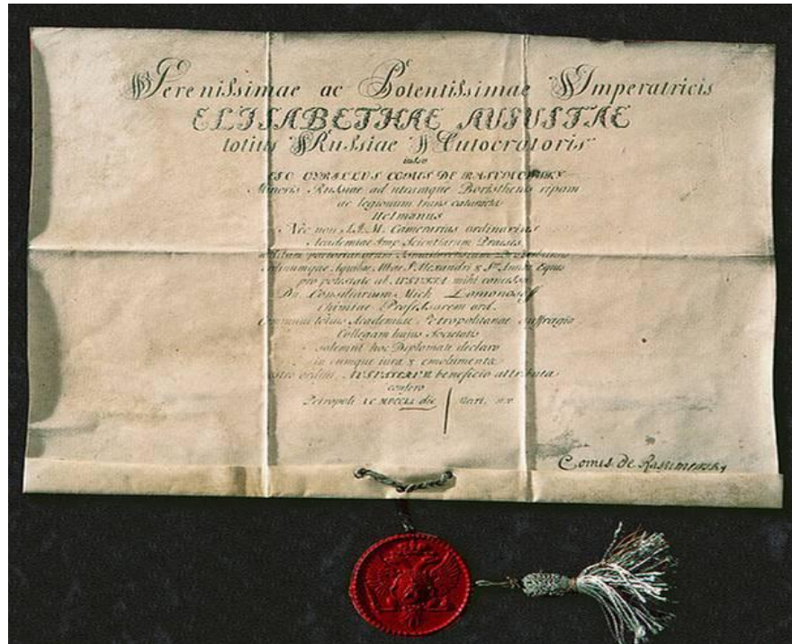
The Professor of chemistry diploma

□ In 1742 Lomonosov was appointed as an adjunct of physics at the St. Petersburg Academy of Sciences. At the age of 34 Mikhail Vasilyevich became a Professor of chemistry.