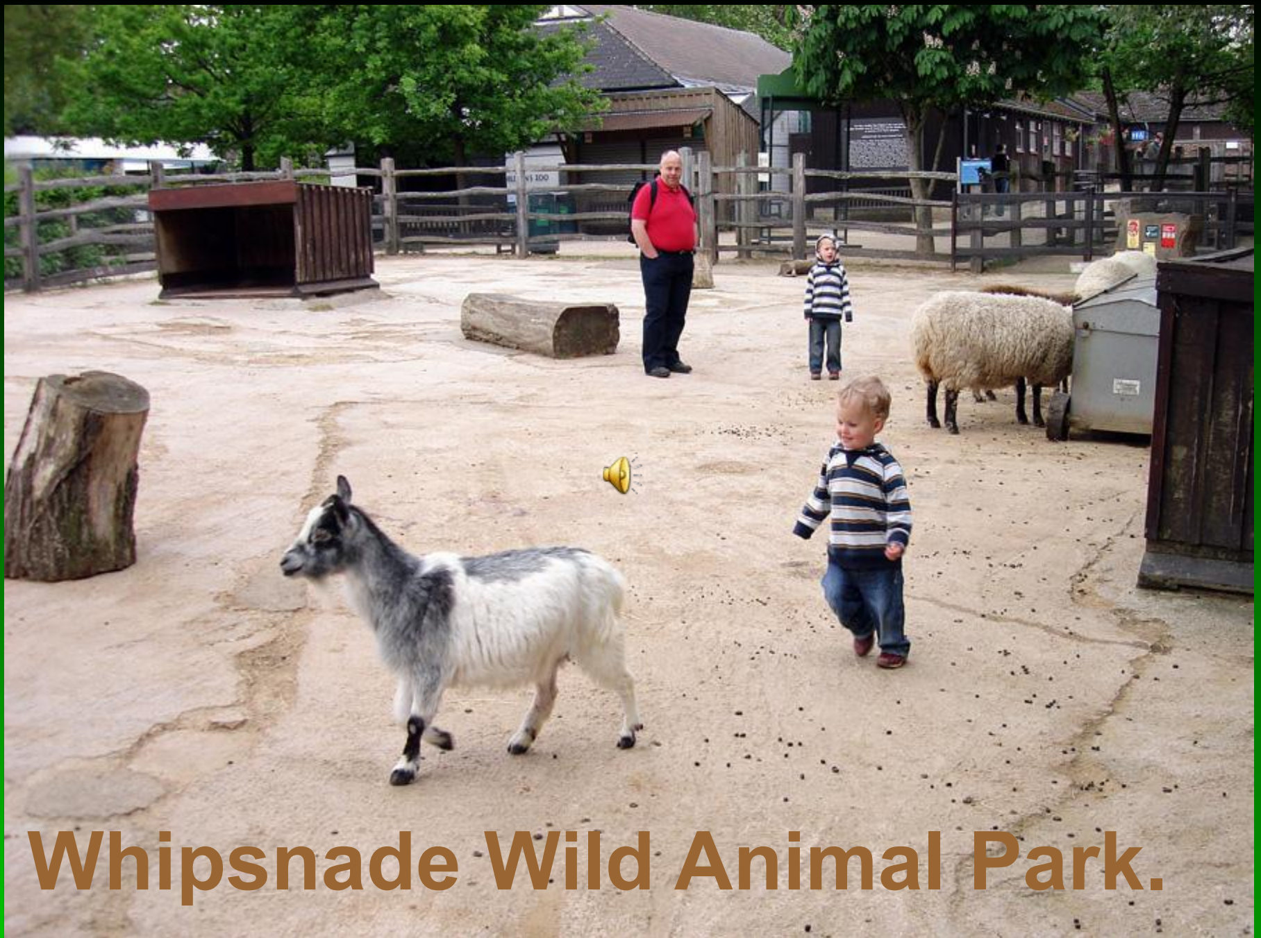
Whipsnade Wild Animal Park.